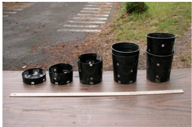
Figure 3. Experimental units were buried in pots trimmed according to treatment (from left, non-buried, buried in 3 cm, 9 cm, 15 cm, and 25 cm of sediment).