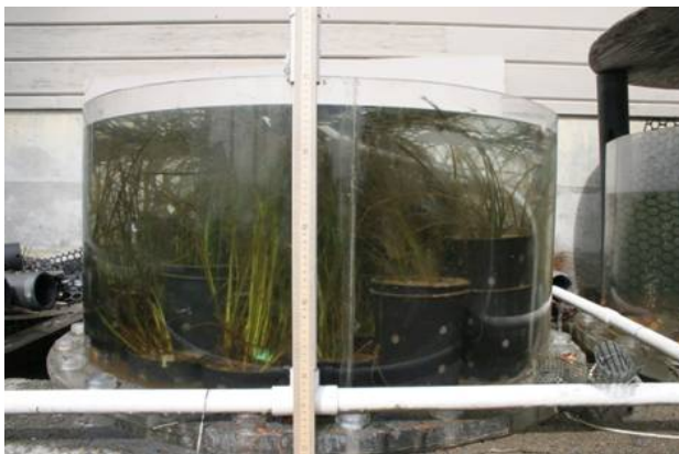
Figure 2. The mesocosm with all 25 experimental units.

Burial treatments were initiated 5 days later, on 29 August 2007, in order to allow experimental units time to adjust to the mesocosm environment. Each separate experimental unit was planted and buried upright in the sediment matrix in a 15-cm-diam plastic pot (Figure 3). Quikrete® play sand was used as proxy sediment for burial treatments because this sand is sterilized and free of contaminants. Using a Ro-Tap shaker and nest of sieves, average grain size was determined to be within the range of “coarse sand” (mean = 1.64\Phi \pm 0.17 ( \pm standard error)), which is similar to a sediment grain size found in natural P. scouleri beds where samples were collected. Sand was soaked for 3 days in a flow-through seawater tank prior to use. Pots were cut according to the depth of the sediment burial treatment, perforated, and lined with permeable landscape cloth to increase