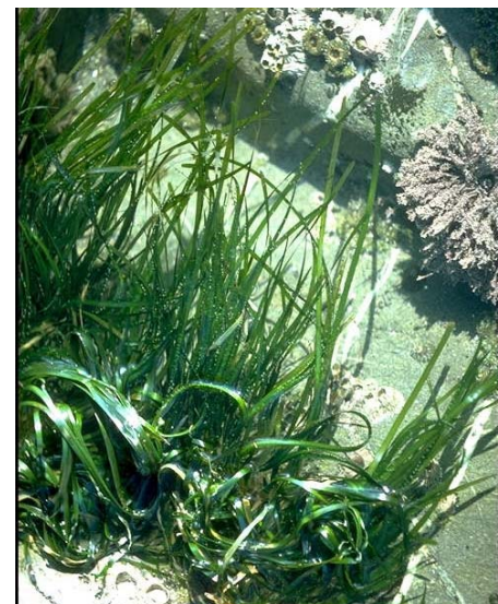
Figure 1. P. scouleri at Cattle Point, San Juan Island, Washington.

PURPOSE: This technical note summarizes the results of an experiment designed to investigate the short-term effects of sediment burial on the surfgrass Phyllospadix scouleri (Figure 1). P. scouleri inhabits rocky shorelines from Southeast Alaska to Baja California along the Northeast Pacific coast of North America (Wyllie-Echeverria and Ackerman 2003).