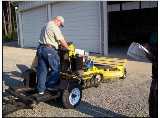
Figure 15: Off-Loading Peco Cutter

Manual operation of the Peco Cutter is necessary when loading and off-loading it from its travel trailer, as shown in Figure 15 and 16. Modifications to the Peco Cutter's manual driving mechanism include the addition of a driving joystick to make it possible for any operator to control movement of the Peco Cutter. Throughout the test, manual operators were able to successfully load (and off-load) the Peco Cutter in less than 1 minute.