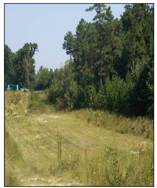
Figure 19: After Cutting, Test Site A

Operational cutting on the downward slope of Test Site B was separated into two timed tests. For the first test, the cutter was operated for 40 minutes. This resulted in a cleared area of 29.3 m \times 9.4 m (6.9 m<sup>2</sup>/min, or 413.1 m<sup>2</sup>/hr) over ground with an average slope of 6.5 degrees. During this test, the gully described in Section 3.2 was encountered, requiring the operator to perform special maneuvers to continue cutting operations around and through the rut (see Figure 20). The heaviest vegetation cut in this area was an 8 cm diameter tree.