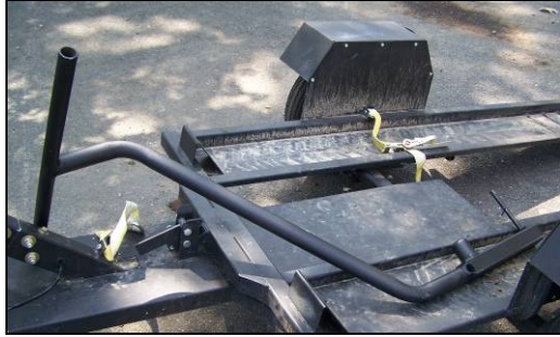
Figure 32: Trailer with Removable Handle (Handle is Lying on Trailer, Not Connected)