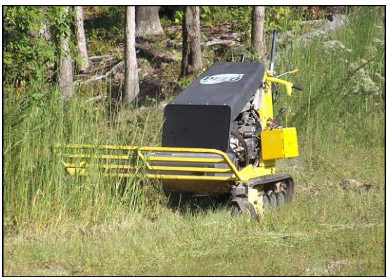
Figure 1: Peco Tracked Brush Blazer TBB-2001

The Peco Tracked Brush Blazer TBB-2001, referred to as the Peco Cutter, shown in Figure 1, is a heavy-duty brush cutter advertised as capable of cutting heavy undergrowth and trees up to 10 cm in diameter. It is equipped with a hydraulic track drive that gives the operator the ability to maneuver in all types of terrain, as well as perform 180-degree turns within its own length of 2.4 meters. Safety features of the Peco Cutter include a chain-guarded deck (Figure 2) and a front safety bar (Figure 3) to push over vegetation to be cut.