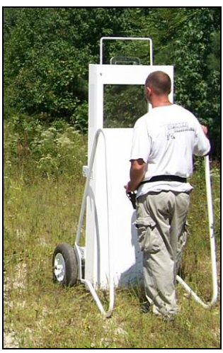
Figure 23: Operator's Shield

Operators of the Peco Cutter said that visibility from behind the shield was sufficient for Peco Cutter operations and that the remote control was easy to use. The best indication of equipment movement was gained by viewing the vehicles track which were visible except when powdery soil conditions caused dust clouds.