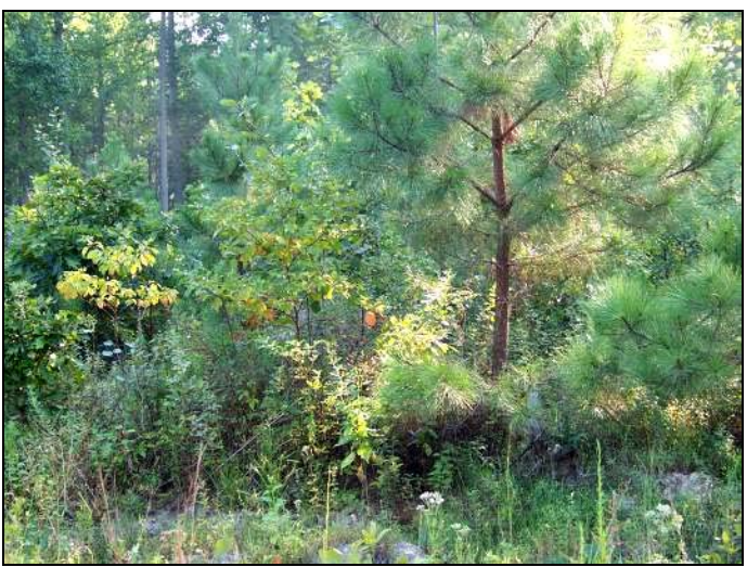
Figure 14: Test Site C, Category 3 Vegetation

The final test site, Test Site C, measured 15 m \times 5 m and consisted of Category 3 vegetation (see Figure 14). Category 3 vegetation includes moderate vegetation with brush, saplings, and trees up to 10 cm in diameter, atop level or lightly rolling terrain with minimal ruts.