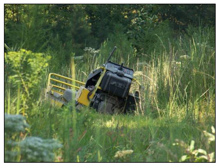
Figure 20: Peco Cutter Encountering 26.7 cm Deep Gully at Test Site B

The second timed test within Test Site B lasted 45 minutes and produced a 24.1 m \times 12.0 m cleared area (6.43 m<sup>2</sup>/min, or 358.8 m<sup>2</sup>/hr). The average slope for this section of Test Site B was 9.9 degrees.