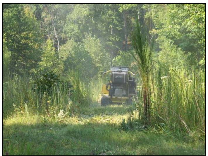
Figure 13: Test Site B, Category 2 Vegetation