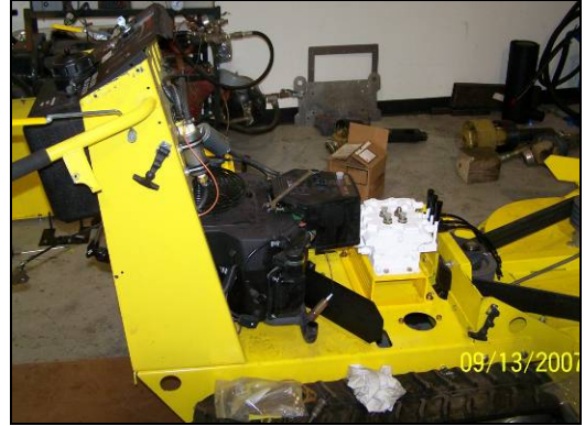
Figure 4: Peco Cutter Engine Before Modifications (Top Cover Removed in Photo)

Modifications to allow for push-button manual operations as well as remote operations were made by the Humanitarian Demining Program Office's vehicle fabrication shop at Ft. Belvoir. The Peco Cutter remote-control system enables operators to start and shut off the Peco Cutter engine remotely, enable and disable the cutter remotely, and continue line-of-sight operations for distances up to about 400 meters. Photos of the modifications can be found in Figures 4 through 10. Table 1 lists specifications for the Peco Cutter.