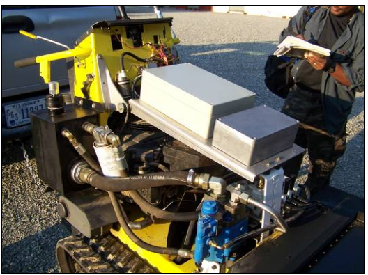
Figure 5: Peco Cutter Engine After Modifications (Top Cover Removed in Photo)