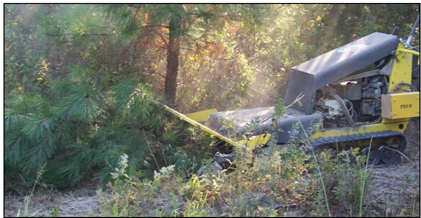
Figure 17: Cutting Heads Engaging Tree After Being Pushed by Safety Bar

The Peco Cutter's cutting ability was tested against Category 1, Category 2, and Category 3 vegetation within Test Sites A, B, and C, respectively. In Test Site A, approximately 2,000 m<sup>2</sup> were cut, with no mobility or operational issues. Figures 18 and 19 show before and after cutting views of Test Site A.