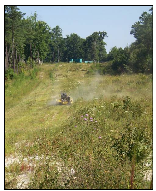
Figure 18: Cutting Operations, Test Site A

The Peco Cutter's cutting ability was tested against Category 1, Category 2, and Category 3 vegetation within Test Sites A, B, and C, respectively. In Test Site A, approximately 2,000 m<sup>2</sup> were cut, with no mobility or operational issues. Figures 18 and 19 show before and after cutting views of Test Site A.