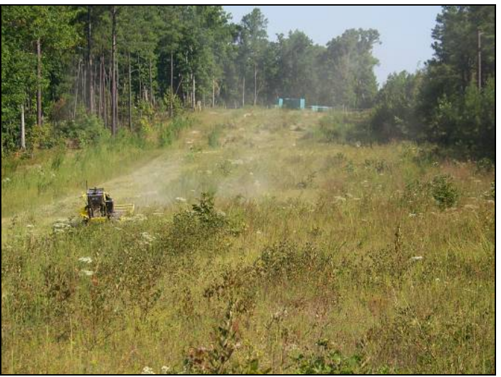
Figure 12: Test Site A, Category 1 Vegetation

Test Site A consisted of Category 1 vegetation within a 350 m \times 60 m area, as shown in Figure 12. Category 1 vegetation is described as light vegetation with saplings up to 3 cm in diameter within level to slightly rolling terrain.