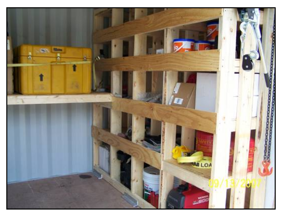
Figure 35: View of Inside Shipping Container

ensure continued operation of the Peco Cutter. Figure 36 shows the fully packed shipping container.