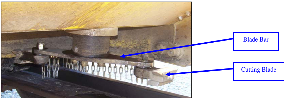
Figure 11: Blade Bar and Cutting Blade (Photo Taken from under the Cutting Deck)