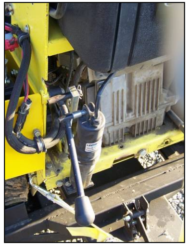
Figure 9: Cutter Engaging Lever After Modifications (Hydraulic Addition allows Operator Push-button Cutter Engagement)