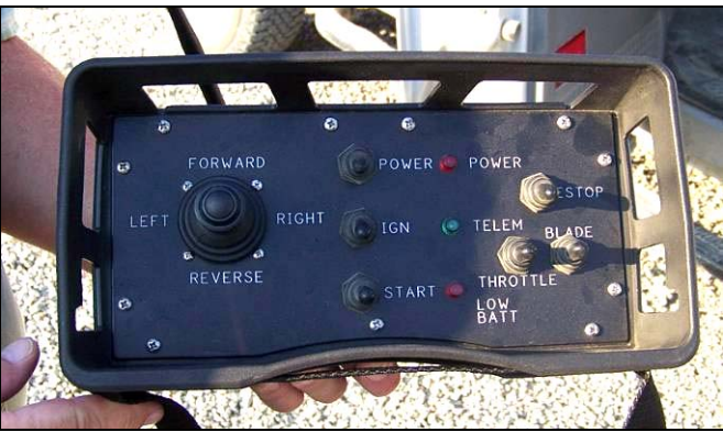
Figure 10: Hand-held Remote Control Device