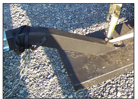
Figure 33: Trailer Connecting End, Before Modifications