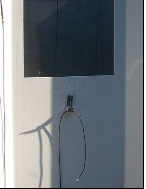
Figure 26: Remote Device Hook and Antenna Cable