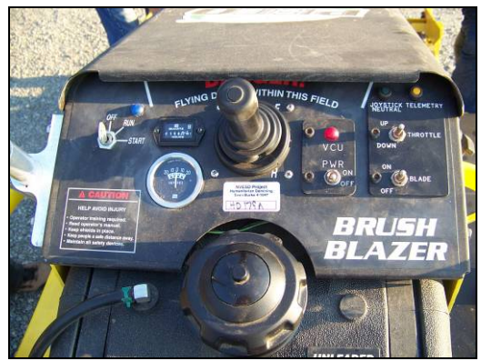
Figure 7: Instrument Panel After Modifications