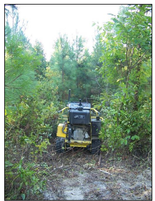
Figure 21: Peco Cutter Entering Test Site C

achieved at distances of about 400 meters. Note, however, that operating at this distance from the machine does not produce good cutting results because the operator does not have a clear view of the machine and the cutter.