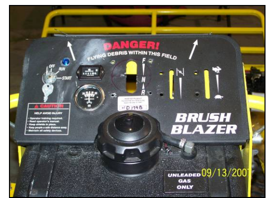
Figure 6: Instrument Panel Before Modifications (Note: Panel Levers Are Removed)