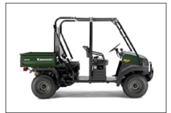
Figure 29: 4×4 Utility Vehicle, Used in the Damaged Vehicle Recovery Test

In addition to the manual recovery of a disabled vehicle, recovery by a small vehicle was also tested. A 4\times4 utility vehicle, like the one shown in Figure 29, weighing 693.5 kg (1,528.9 lbs) was used to tow the Peco Cutter from its location. Although the utility vehicle was very close in weight to the Peco Cutter, it was able to successfully drag it several feet.