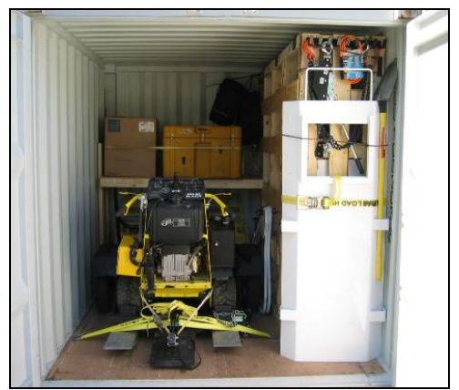
Figure 36: Packed Shipping Container