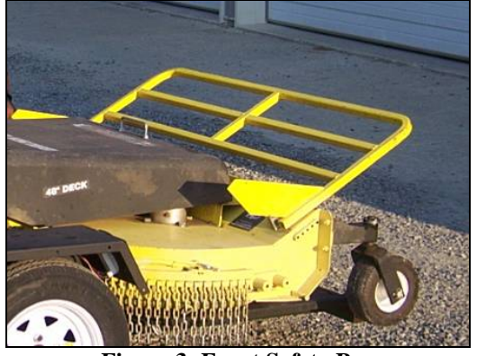
Figure 3: Front Safety Bar