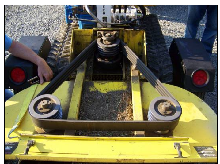
Figure 28: Cutting Blade Belt (Top Cover Removed for This Photo)

During the test, one maintenance issue arose. It was noticed that although the Peco Cutter's cutting blades seemed to be rotating, the vegetation was not being cut. An inspection of the problem showed that the wide belt responsible for turning the blades was loose (see Figure 28). A quick adjustment to the tension rod was made, and the Peco Cutter resumed cutting. This repair took only a few minutes and required no tools.