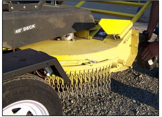
Figure 2: Chain-guarded Cutting Deck