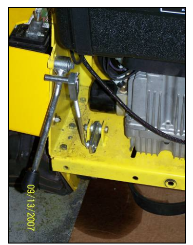
Figure 8: Manual Cutter Engaging Lever Before Modifications