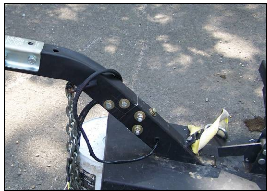
Figure 34: Trailer Connecting End, After Modifications