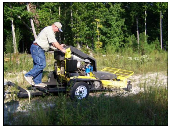
Figure 16: Loading Peco Cutter onto Trailer