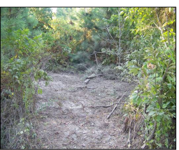
Figure 22: Test Site C, Cutting Complete