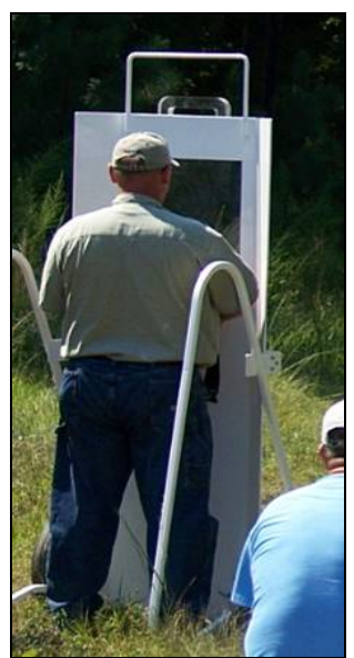
Figure 24: Operator Working Close to Shield