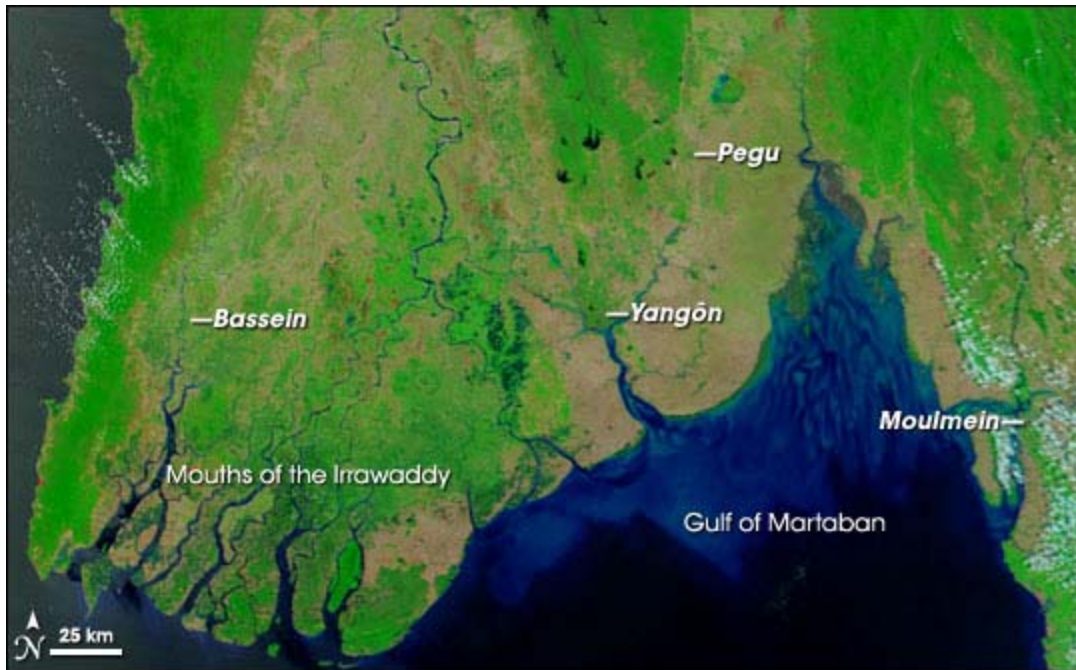
April 15, 2008