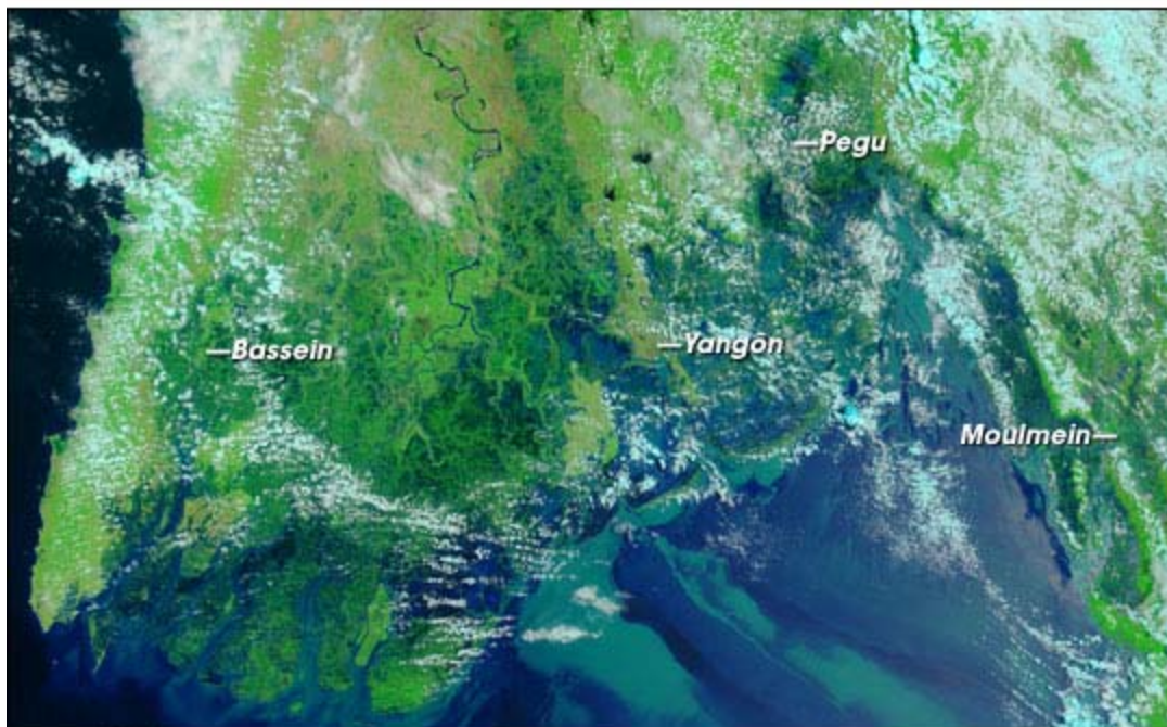
May 5, 2008

Relief efforts were slowed or non-existent as the Burmese military rulers initially refused aid from outside the country. By May 12-20, 2008, the US Department of Defense coordinated $1.2 million dollars of relief supplies on 36 USAF C-130 flights. The relief supplies would provide needed help to some 113,000 storm victims. Much more aid was needed.