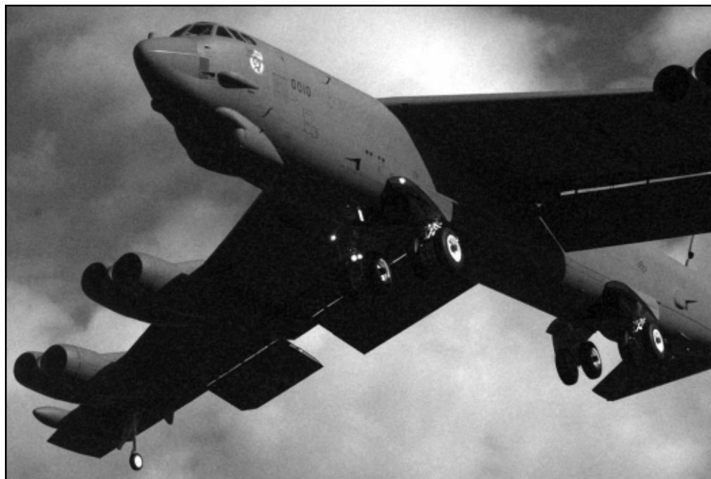
The B-52 Bomber

Based on program descriptions in the milestones database, two of the aircraft were singled out as having benefited from inherited technology, thereby causing each to experience an abbreviated development cycle. North American's F-100 Super Sabre evolved from its F-86 Sabre. In addition, the firm had invested one year of its own in development before working with the Air Force. Grumman's F-14 inherited engines and avionics from the