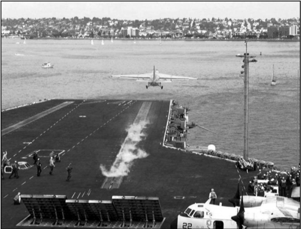
An S-3 Viking, attached to Air Anti-submarine Squadron Three Three (VS-33), takes off from the flight deck of USS John C. Stennis (CVN 74) in the San Diego Harbor.