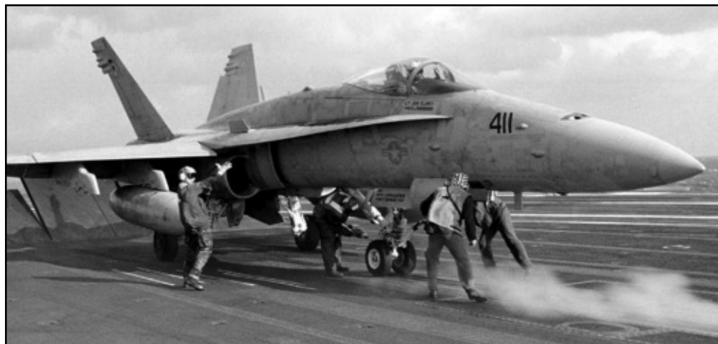
The databases most recent tactical aircraft – the F-18A

1992. Low-rate initial production began in March 1997, with delivery of the first operational unit occurring in December 1998.