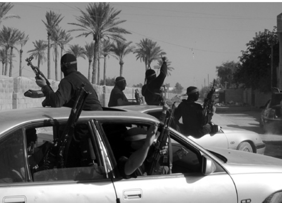
Armed militants drive through Ramadi, Iraq, 5 December 2006.

U.S. Marine Corps aircraft arrived overhead to perform “show of force” sorties designed to intimidate the insurgents and convince them that air attack was imminent. Next, a ground reaction force from Task Force 1-9 Infantry began preparations to move to the area and establish defenses for the Albu Soda tribe. Because we were viewing the area using aerial sensors, our vision of the fight was indistinct, and we were unable to separate insurgents from the friendly tribesmen. We did not want to attack the friendly tribe by mistake, so we undertook actions to intimidate the insurgents by firing “terrain denial” missions. Explosions in empty nearby fields raised the possibility of suppressive artillery fire in the minds of the enemy. Complemented by the roar of fighter jets, the startled AQIZ forces became convinced that massive firepower was bearing down on them. They started to withdraw, separating themselves from their victims.