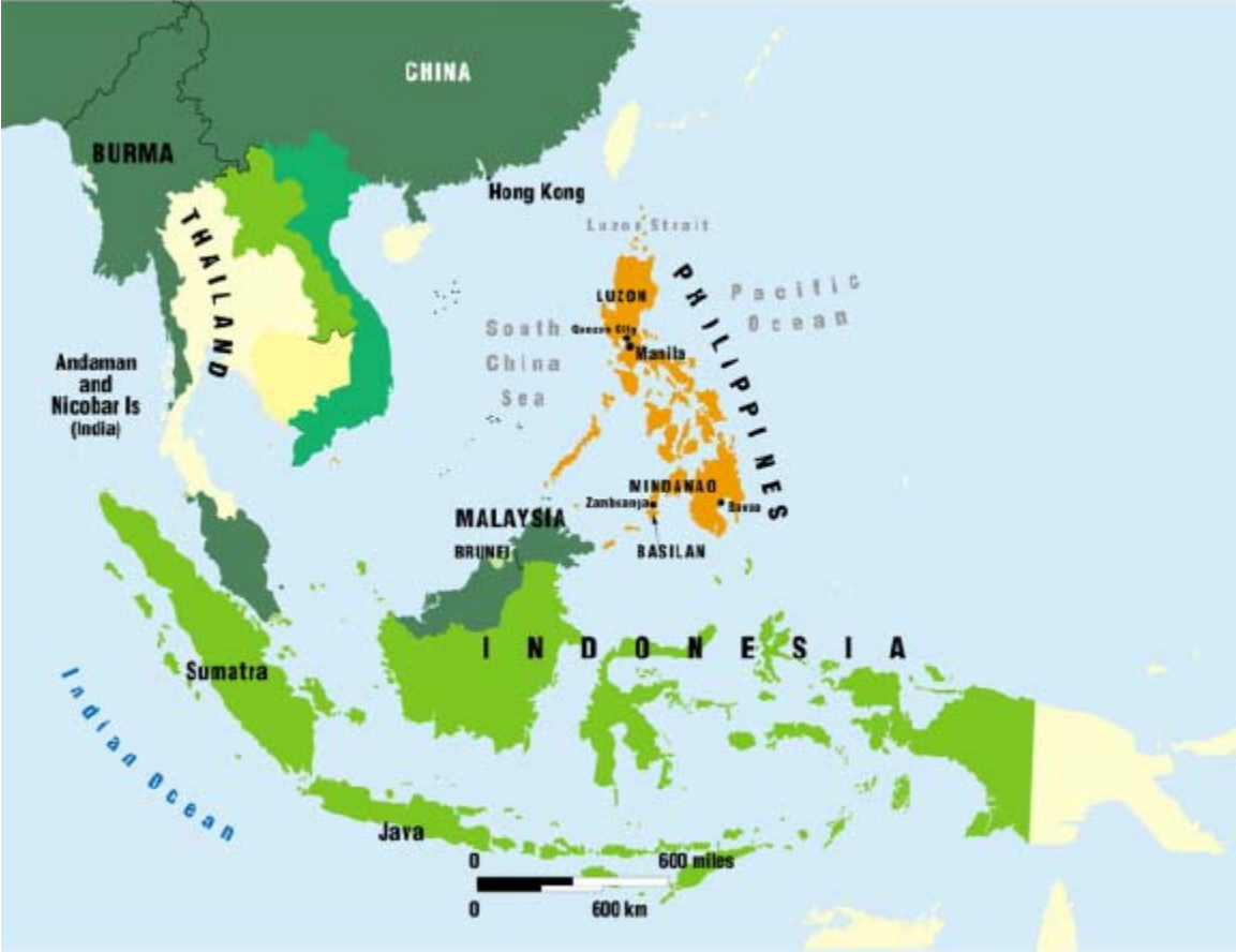
Figure 2. Map of the Philippines and Southeast Asia