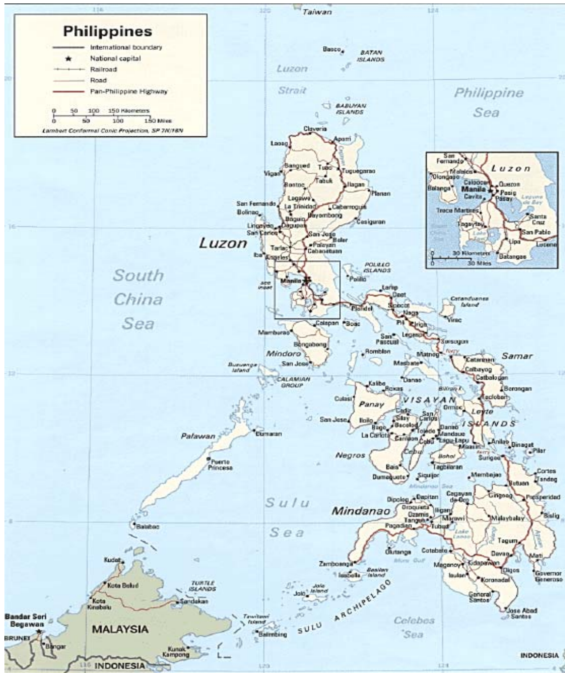
Figure 3. Map of the Philippines (From: ICG Report, 2005)