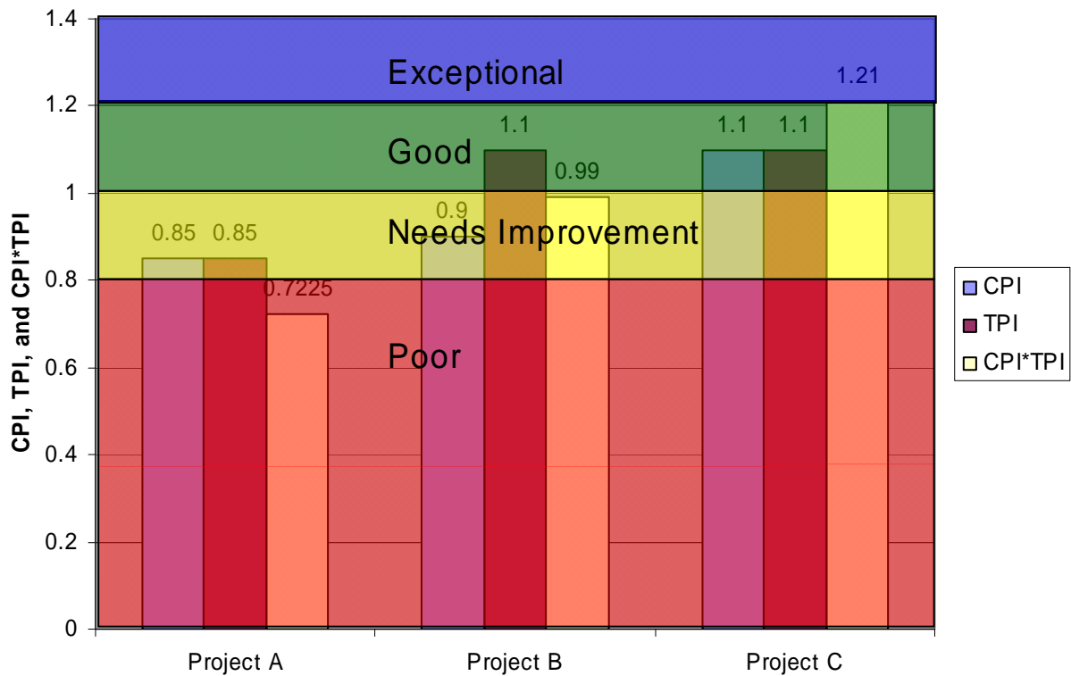
Figure 2 EVA Metric Notional Data