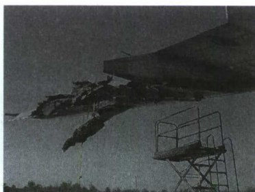
SA-7 damage to DHL Airbus A300, 22 November 2007 (Reproduced from David D. Banholzer, “The Civil Reserve Air Fleet: A Vulnerable National Asset,” Naval War College, Newport, RI, 2006, 6.)

Finally, a worst-case scenario—a foreign carrier, following activation, withdraws from the CRAF altogether and “reflags” its aircraft to its country of origin. 44 The best explanation of the legal concerns of US government leverage over foreign carriers was expressed by an aviation lawyer who stated that “in a game of poker, the US government has all the cards when playing with a US carrier. The game is entirely different when there is a foreign airline aligned with its government.” 45 Beyond mere speculation, our military has firsthand experience with foreign carriers unwilling to participate or to fulfill their commitments. In both ODS and OIF, there were instances where committed foreign sea and air carriers either refused or caused critical delays in the delivery of cargo into the AOR. A stark example during