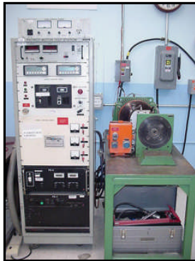
Figure # 1 PATRIOT Motor Test Station

The existing transmission used in the test station was worn from more than twenty years of use and a replacement was not readily available. LEAD had experienced problems with the transmission in the past and requested the National Center for Defense Manufacturing and Machining (NCDMM) provide a reliable solution to extend the life of the existing test station. The original transmission manufacturer is no longer in business and the transmission is not easily repairable. This test station is the only method of testing the PATRIOT motors in a production environment.