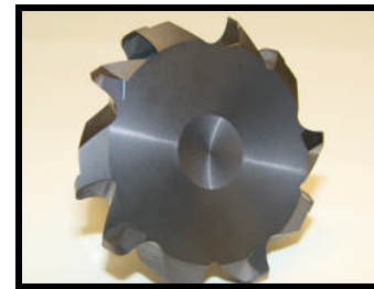
Figure #2: Slot Cutter in Shrink Fit holder

By utilizing these advanced technologies and methodologies developed and implemented by the NCDMM engineers and its alliance partners, successful machining of the pockets and grooves has been accomplished. Transitioning of this technology reduces machining time as well as significantly increasing part quality.