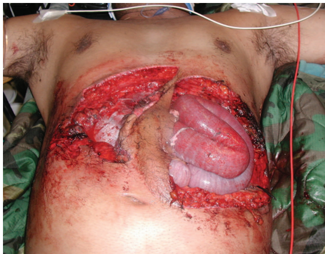
Fig. 4. Casualty with Abdominal Wall Destruction.

nonpreventable, one potentially preventable, and one preventable. Both the potentially preventable and preventable death resulted from complications occurring at higher echelon medical facilities after the patient left the SSTP.