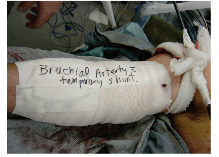
Fig. 1. Improvised patient information communication strategy.

The reason for this lack of information flow was multifactorial, but included communication failures, operational tempo, casualty acuity, casualty load, etc. The goals at the system level were to improve clinical information flow, thereby minimizing the number of duplicate procedures at multiple levels of care and streamlining the continuity of care for soldiers being evacuated from the battlefield. Several strategies are currently being implemented to correct this problem, including universal serial bus memory devices and Internet-accessible electronic medical records. One particular instrument was developed