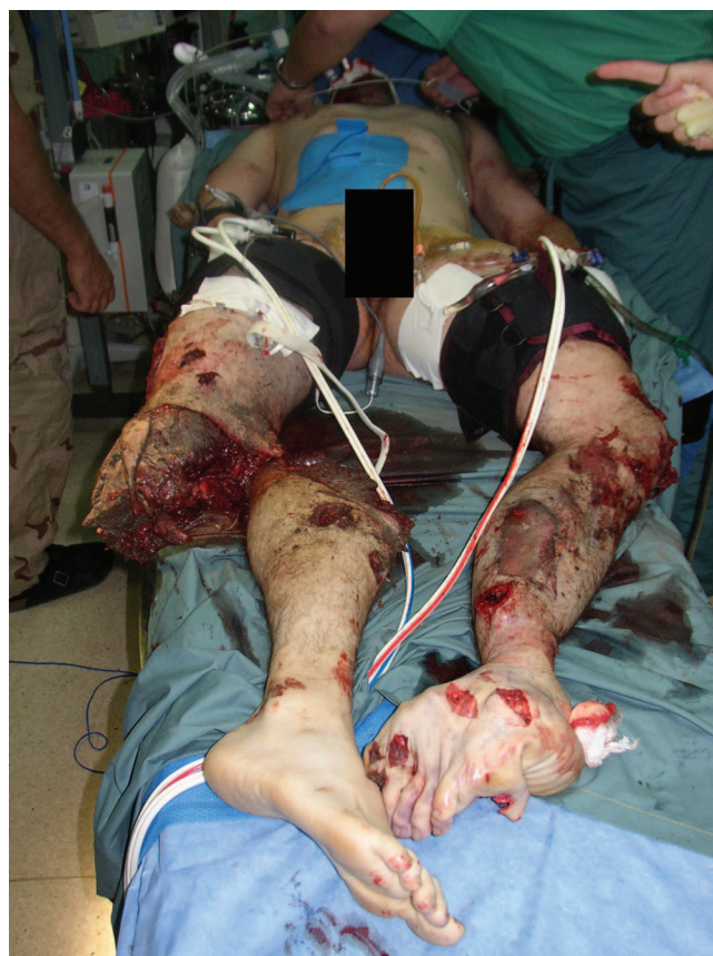
Fig. 2. Patient with traumatic amputation on right and mangled leg on left, controlled with pneumatic tourniquets.

This difference is likely related to the physical findings that would prompt a medic to place a tourniquet. Patients who required primary or debridement amputations frequently had dramatic appearing traumatic amputations (Fig. 2), mangled extremities (Fig. 3), or severe soft tissue components to their wounds (Fig. 4). Patients with reconstructable vascular injuries were more likely to have less soft tissue and bony destruction and contained hematoma without active bleeding (Fig. 5). Hence, medics were less likely to place a tourniquet on these injuries.