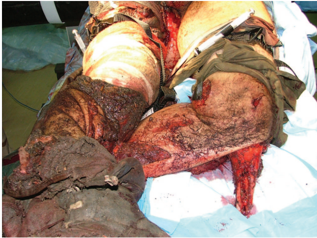
Fig. 3. Patient with bilateral mangled lower extremities/traumatic amputations, hemorrhage controlled with Special Operation Forces Tactical Tourniquet (SOFTT).