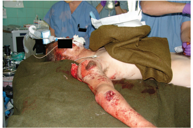
Fig. 5. Patient with multiple fragment wounds to right upper extremity. Brachial artery and vein were transected but contained in a hematoma.

on survival, incidence of neurologic injury, and ischemia-related complications.