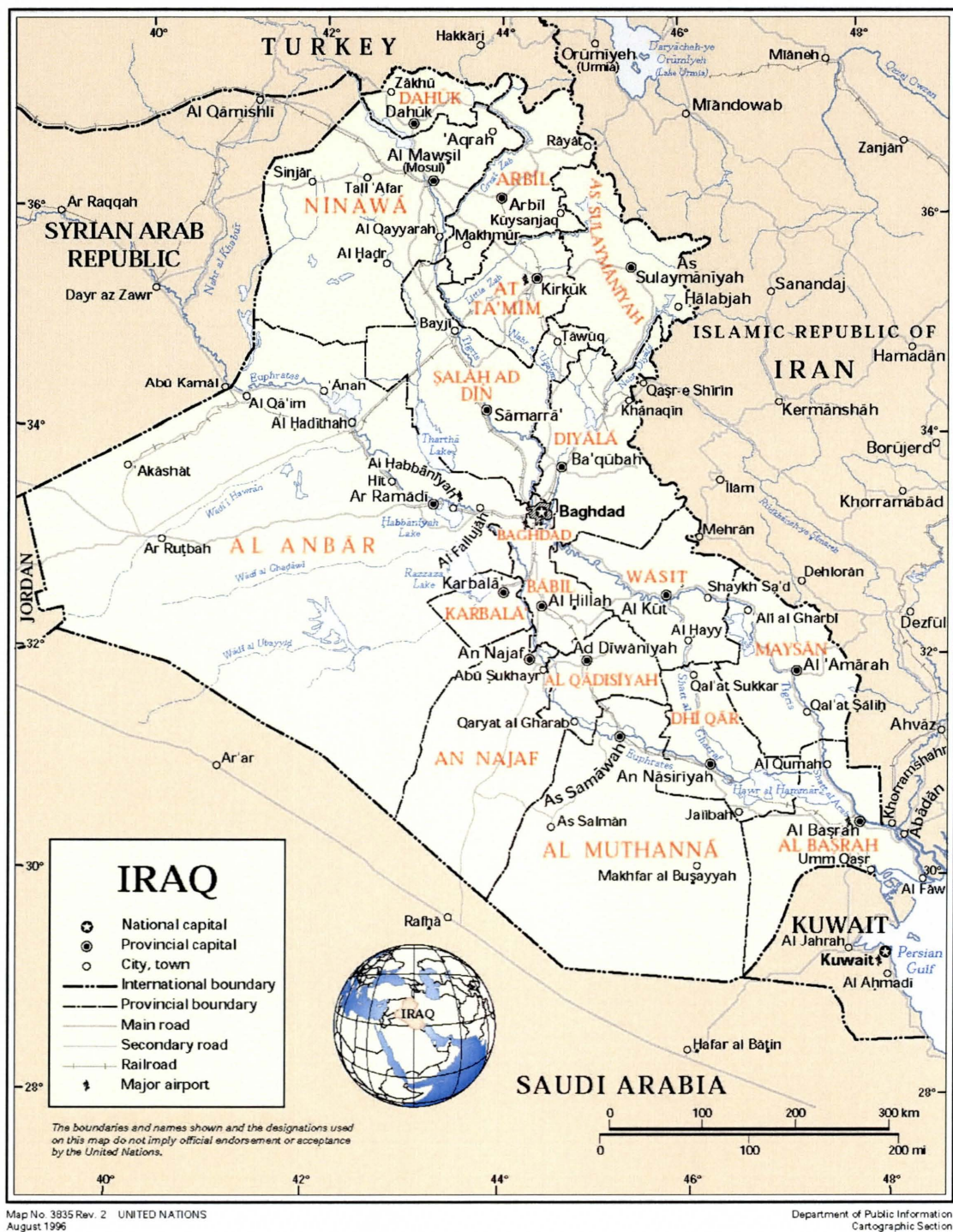
Figure 1. Iraq