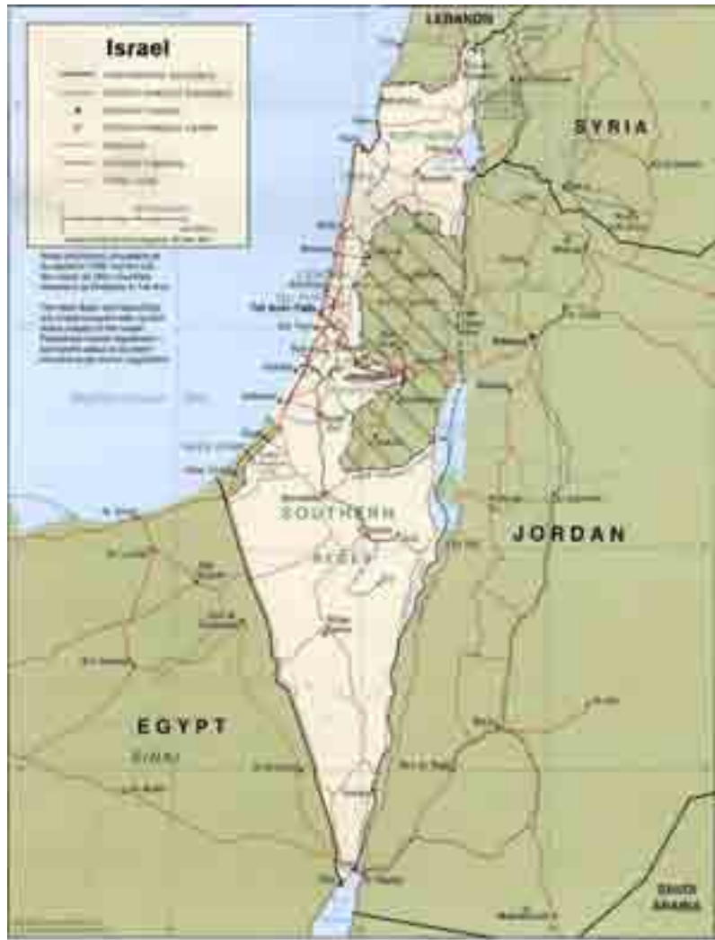
Israel Political Map (Source: Perry-Castaneda Library Map Collection) http://www.lib.utexas.edu/maps

There are nearly four million Palestinians living in the West Bank and Gaza Strip. Moreover 3.7 million Palestinians live in Lebanon, Syria and Jordan. 19 Since the establishment of the State of Israel they have been fighting to have their own state. Currently the area in question includes the West Bank and Gaza Strip which were taken from Egypt and Jordan in the 1967 Arab-Israeli war. 20 These territories are referred to by Palestinians as occupied territories. Israel claims their status as “disputed territories”. Current law status of the West Bank and Gaza Strip is based upon the Israeli-Palestinian Interim Agreement which also established Palestinian administration in most parts of the West Bank and Gaza Strip. Permanent status of the occupied territories is to be determined through further negotiation. 21