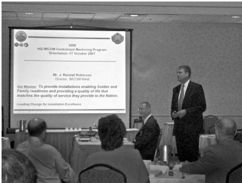
Figure 1. IMCOM Centralized Mentoring Program 2007 Orientation

“enhance employee professional and career development, to promote opportunities for professional success, and to encourage succession planning.” 47 President George Bush summed up the importance of mentorship during his 2003 inaugural speech, “one mentor, one person, can change a life forever. And I urge you to be that one person.” 48