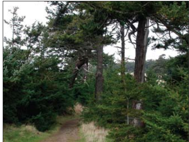
Figure 3. Shoreline prairie community on San Juan Island (left) and wind-stressed trees (right).