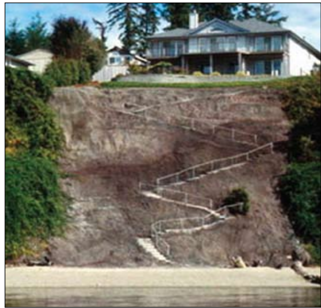
Figure 4. Examples of anthropogenic disturbances that result in changes (left) or elimination (right) of natural vegetation on shorelines.