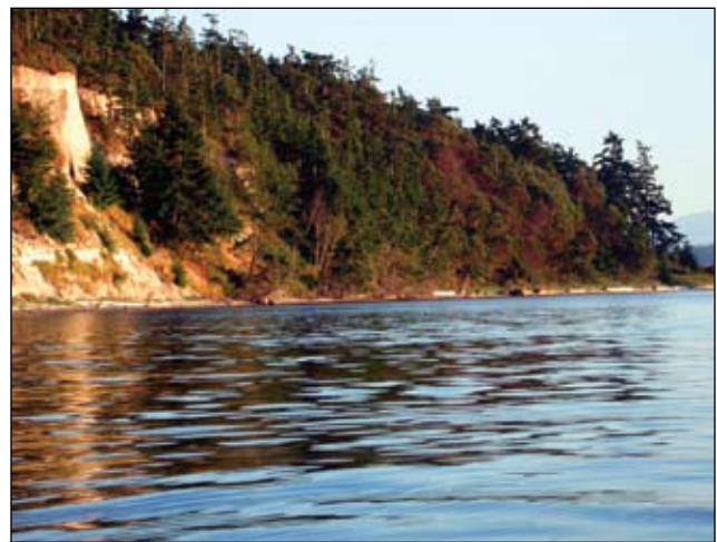
Figure 2. Photos depicting natural erosion (left) and vegetation patterns (right) on a steep bluff.