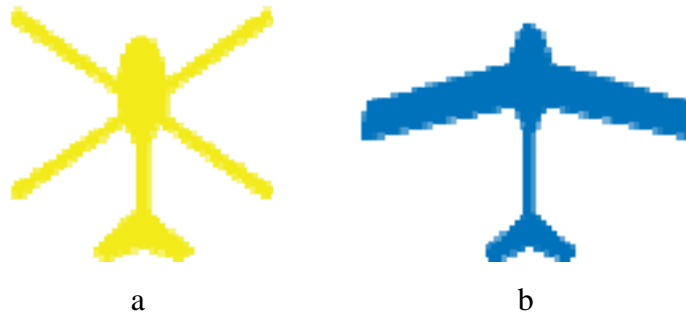
Figure 1: Examples of new UAV symbology developed for this study. (a - Rotary-wing UAV, unknown affiliation; b - Fixed-wing UAV, ownship)

In evaluating the relative merits of MIL-STD-1787C versus MIL-STD-2525B, and in the development of new UAS symbologies, several issues should be considered including situation awareness, recognition speed, and errors associated with processing information. In the present study, a set of UAS symbols was developed for evaluation in the context of MIL-STD-1787C symbology. Symbols for both fixed-wing and rotary-wing unmanned air vehicles (UAVs) were created (see figure 1). The symbols were developed in accordance with the standard human factors criteria that the symbols must allow one to rapidly recognize the symbols and accurately distinguish the symbols from other related symbology. The symbols were then utilized and evaluated in several simulated UAS operator tasks. The aim of this study was to evaluate the degree to which these newly developed symbols could be effectively utilized within a larger MIL-STD-1787C symbology set for UAS operations.