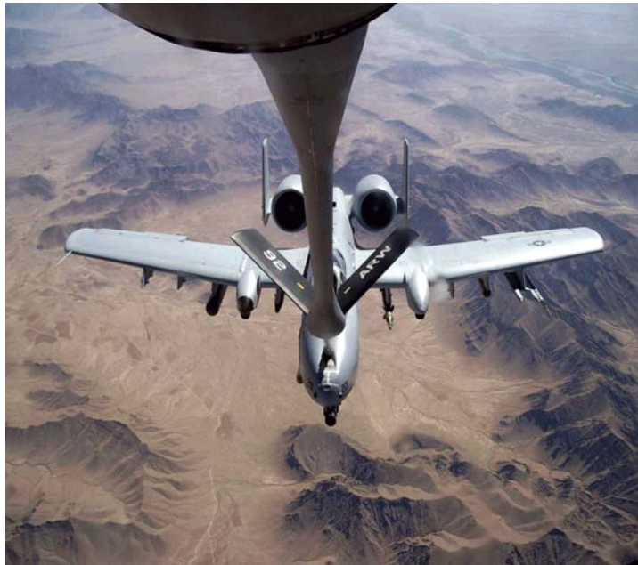
Figure 1. Photo of “Boom” Air Refueling

Boom vs. Probe and Drogue Air Refueling. Receiver aircraft can be equipped to refuel from a boom (most Air Force aircraft) or with a probe and drogue (most Navy, Marine Corps, and allied aircraft). Operational planners must ensure tasked tankers are equipped to connect with their scheduled receiver. 22 Figure 1 contains an example of “boom” air refueling.