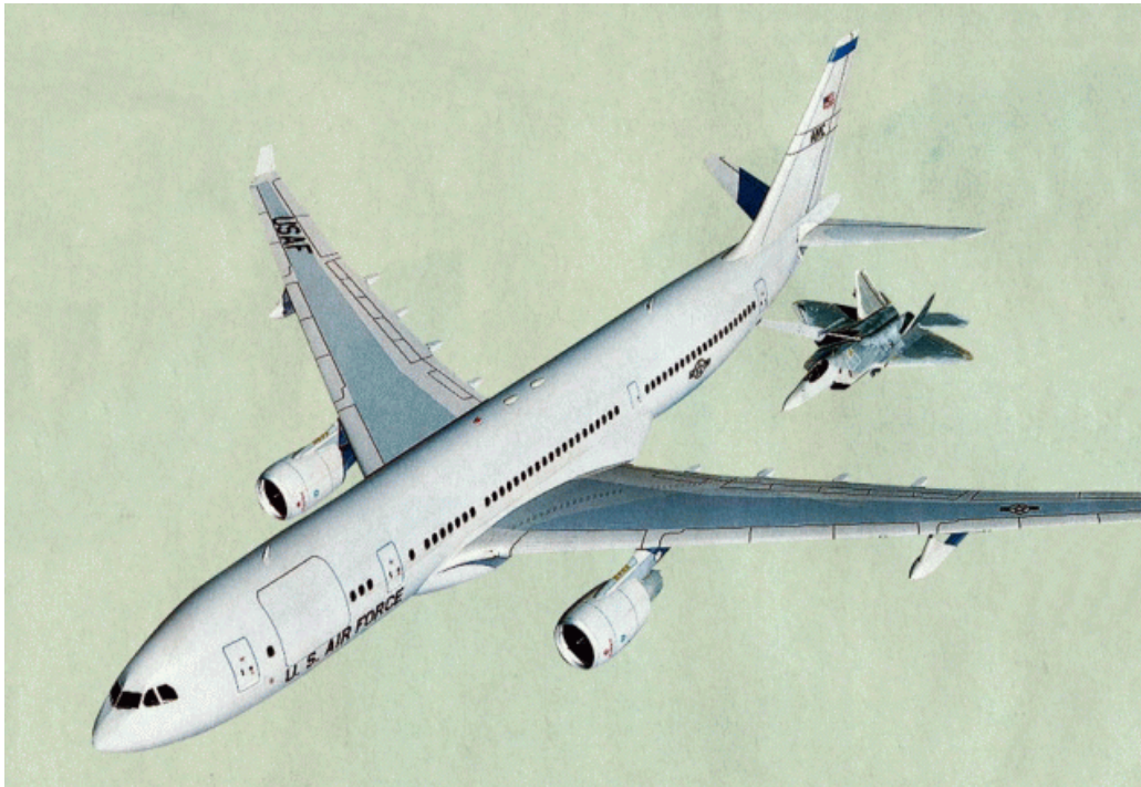
Figure 7. Artist Impression of KC-30