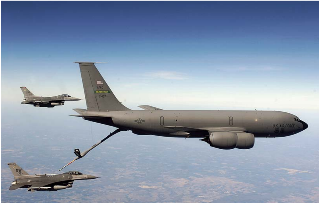
Figure 4. KC-135 Refueling Air Force Fighters