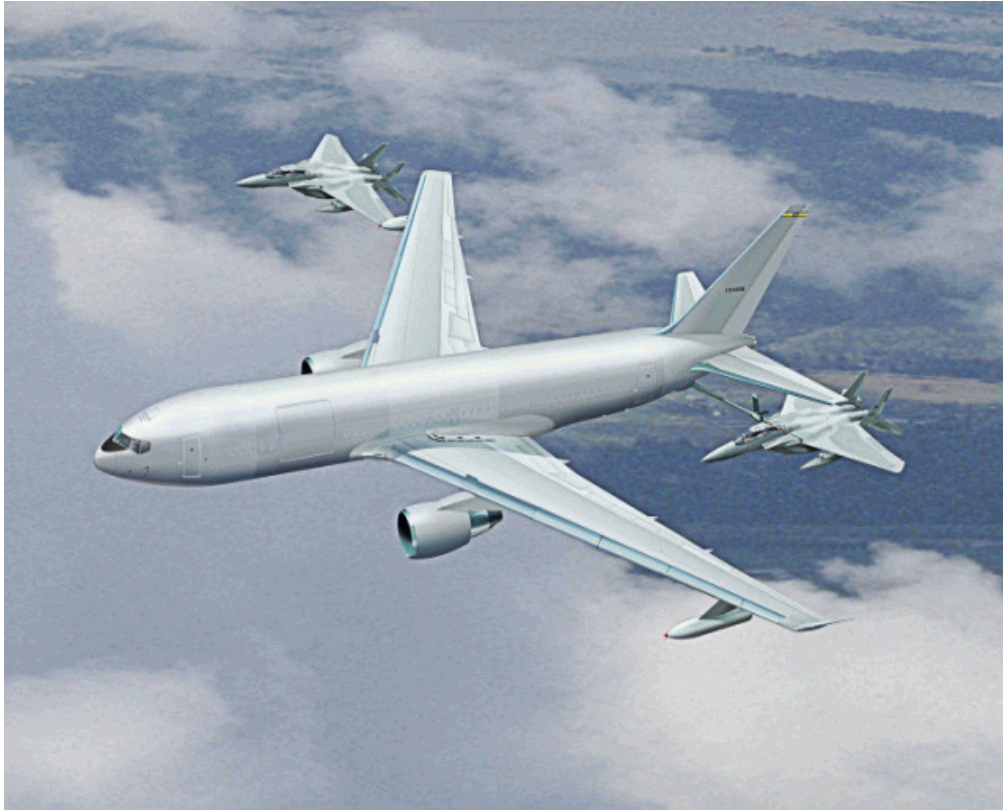
Figure 6. Artist Impression of KC-767