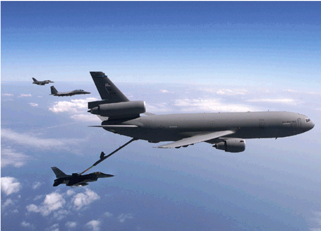
Figure 5. KC-10 Refueling Air Force Fighters