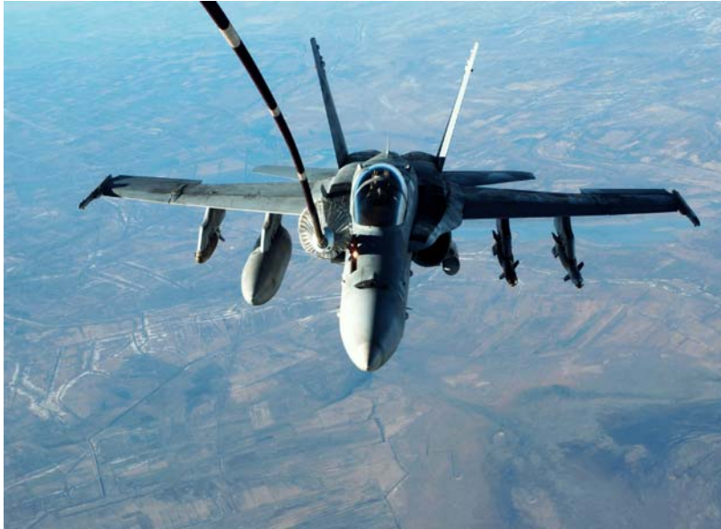
Figure 2. Photo of “Hose and Drogue” Air Refueling