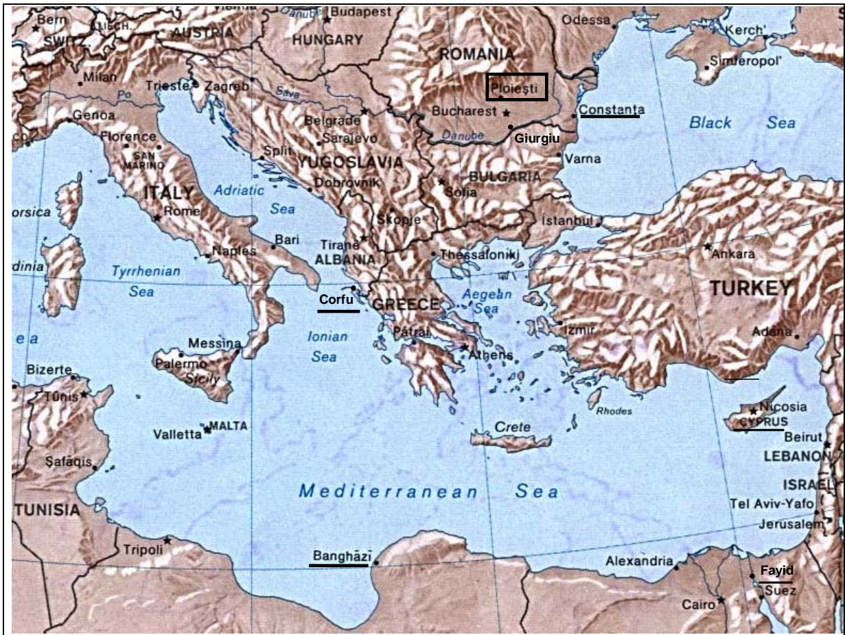
FIGURE 1. THE MEDITERRANEAN BASIN