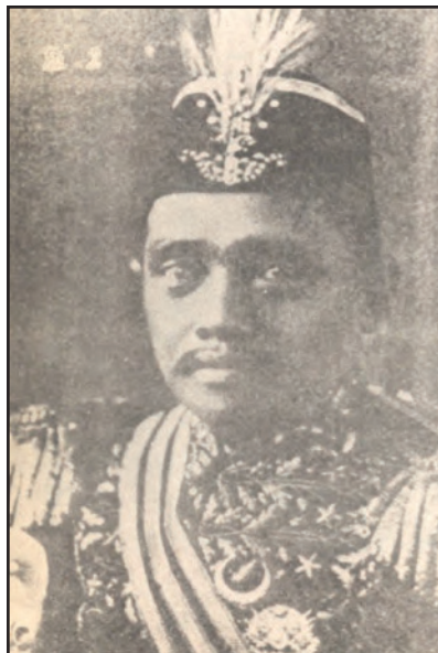
Photo of the Sultan of Sulu, Jamal al-Karim II, who signed an agreement with U.S. forces in 1898 pledging neutrality in the U.S. — Philippines conflict in return for a U.S. pledge of non-interference in the affairs of the Muslim population of Mindanao and the Sulu archipelago.

Almost immediately, in 1903, efforts were begun to implement the provisions of the Organic Act. For the Moro province, like the others, these provisions meant an abolition of slavery; the establishment of new schools in which a new non-Muslim curriculum was provided; the construction of a new provincial government headed by a governor appointed from Manila, whose authority totally bypassed and undercut that of the historic sultans ; and the traditional datus , 457 who viewed themselves as sovereign rulers and substituted a new legal system that replaced and totally ignored the shari'a . From the standpoint of the Moros, but especially their traditional datus , American policy in the Philippines was quickly perceived as more destructive and subversive to traditional culture than Spanish rule had ever been. Accordingly, U.S. authorities governing the Philippines soon found themselves faced with a second insurrection against their presence in the southern Philippines, one even more fierce than the first. The Moro insurrection that got underway just as the first insurrection was being quelled continued until 1914, when U.S. forces finally were able to conclude that the