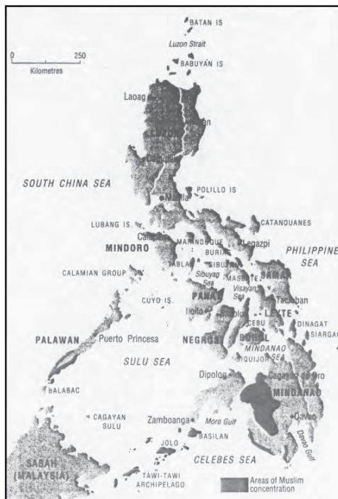
Map of the Philippines showing areas of Muslim concentration.

the largely Protestant orientation of most U.S. administrators led many of them to view the historically dominant role of the Catholic Church in the Philippines with