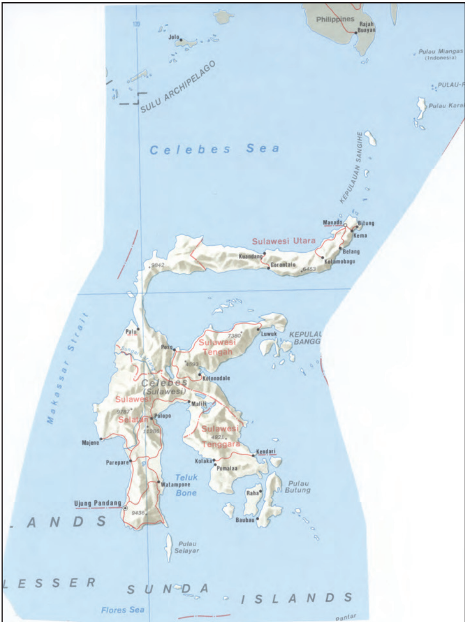
Map of Sulawesi.