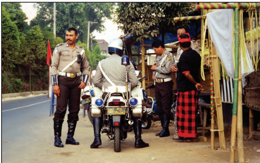
Local police post in Bali in 2000. This was the site of the Jemaah Islamiyah-sponsored bombing of a nightclub in October 2002, which killed scores of tourists.