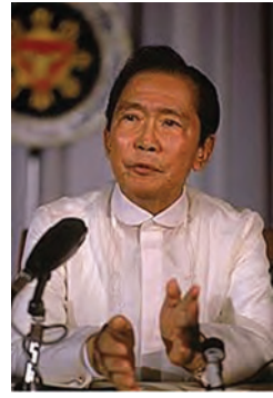
Ferdinand Marcos, controversial long-time President of the Philippines from 1965 to 1986.

The second shock arrived on September 21, 1972, when President Ferdinand Marcos declared martial law throughout the Philippines. Although the communist-inspired New People's Army (NPA), established in 1968, was a growing threat, it did not yet constitute the challenge to government authority posed by the Huk rebellion, its predecessor movement in the 1950s, and the proclamation of martial law only strengthened the appeal of the NPA within the country. 489 The primary reason for Marcos' action appears to have been to lay the basis for arresting and detaining about 30,000 individuals whom he considered part of his political opposition, including rival politician Benigno Aquino. 490 In publicly stating his rationale, however, he gave the principal reasons for the declaration of martial law the existence of armed conflict between Muslims and Christians and a Muslim "secessionist movement" in the southern Philippines. 491 From the perspective of the Moros, the declaration was the final straw. It was a declaration of war against a defeated people who now had no option except that of resistance.