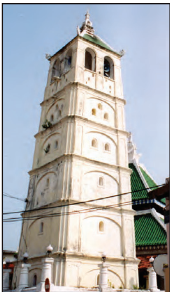
Kampung King Mosque in Melaka, across Strait of Malacca from Sumatra, Indonesia, March 2004.

With the election of 2004, the UMNO and the Barisan Nasional continued to maintain the strong grasp on Malaysian politics it had held since the country gained independence in 1957. Challenged by a revival of Islamic sentiment since the 1970s, the party responded by co-opting Islamic values into its mechanism of governance. However, it had sought to embrace a vision of Islam that coexists with rapid economic development and prosperity. As a result, those with a more “fundamentalist” orientation have continued to be marginalized politically. This pattern is likely to endure for the foreseeable future. The Chinese and Indian elements of the electorate almost guarantee it, as does the ever growing urban, middle class Malay sector. As the 1995 landslide election of UMNO helped to give birth to the militant KMM movement, the frustrated reaction of the same PAS-related elements may give birth to a renewed militant element following the 2004 election. The regime is more alert to the threat to political stability posed by such a development in the post-9/11 world. Malaysian politics is likely to continue to be a rocky road, but continuity is likely to prevail over discontinuity—as it has in the past—for the foreseeable future