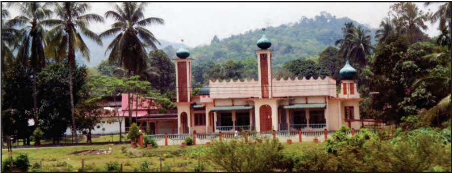
An Islamic mosque in Kota Baru, Kelantan, northern Malaysia, March 2004.