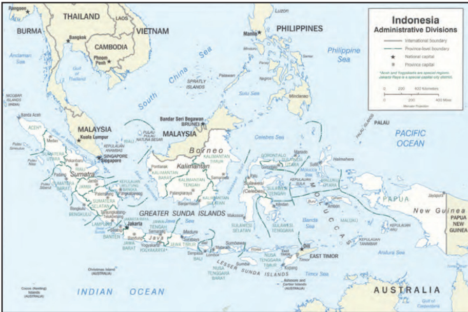
Map of Indonesia.