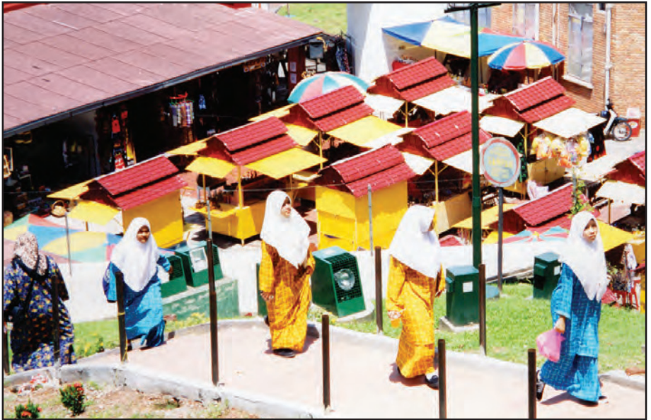
Muslim tourists at St. Paul Hill, Malacca, Malaysia, May 2001.