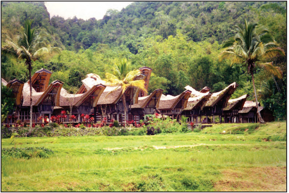
Traditional Tongkanan rice barns in southern Sulawesi.