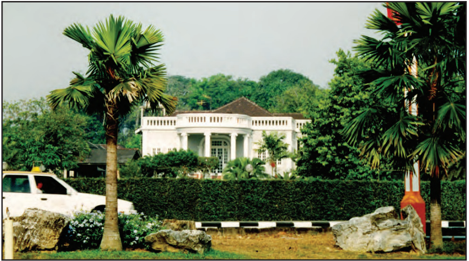
Sultan's palace in Kota Baru, Malacca, Malaysia, March 2004.