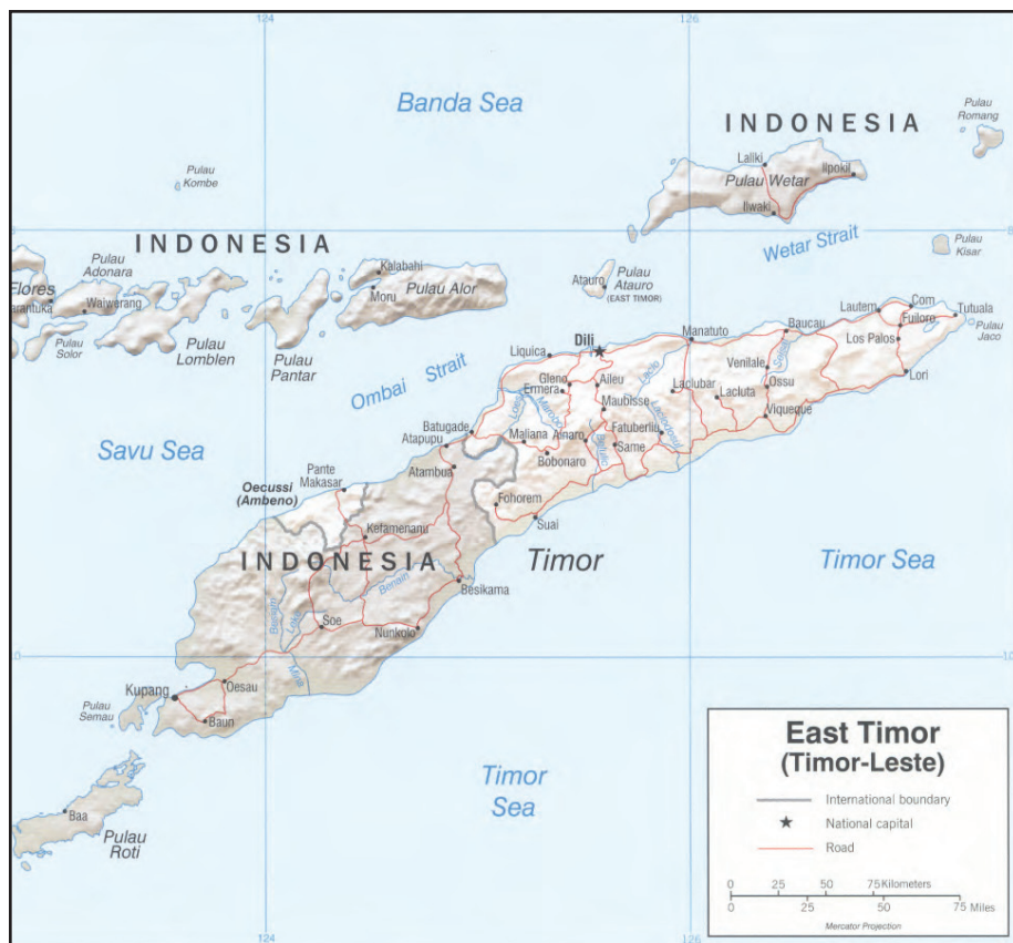
Map of East Timor, long claimed by Indonesia and now a UN protectorate.