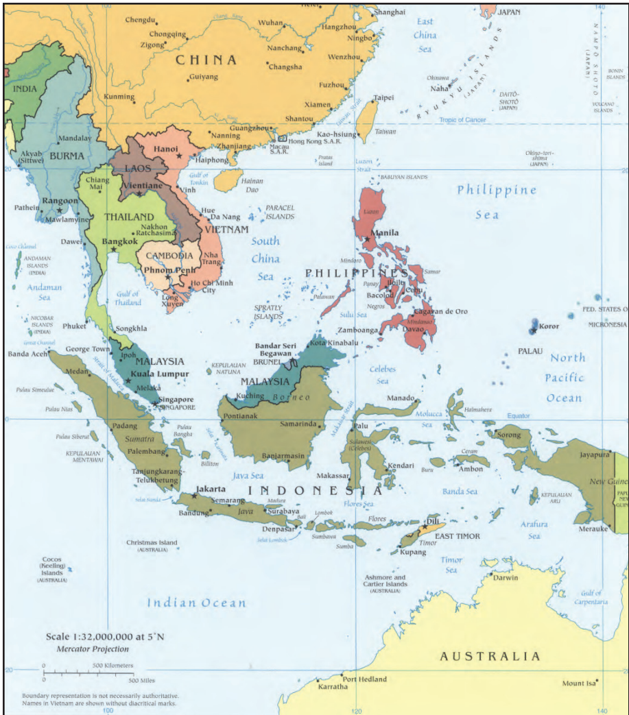
Map of Southeast Asia today.