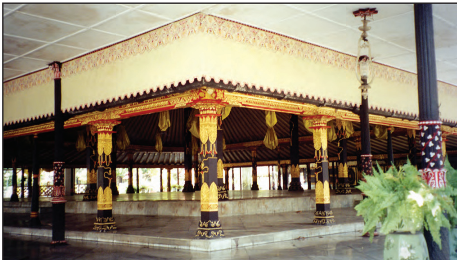
Typical interior room at the Sultan's palace, in Yogyakarta, Java, Indonesia, September 2000.