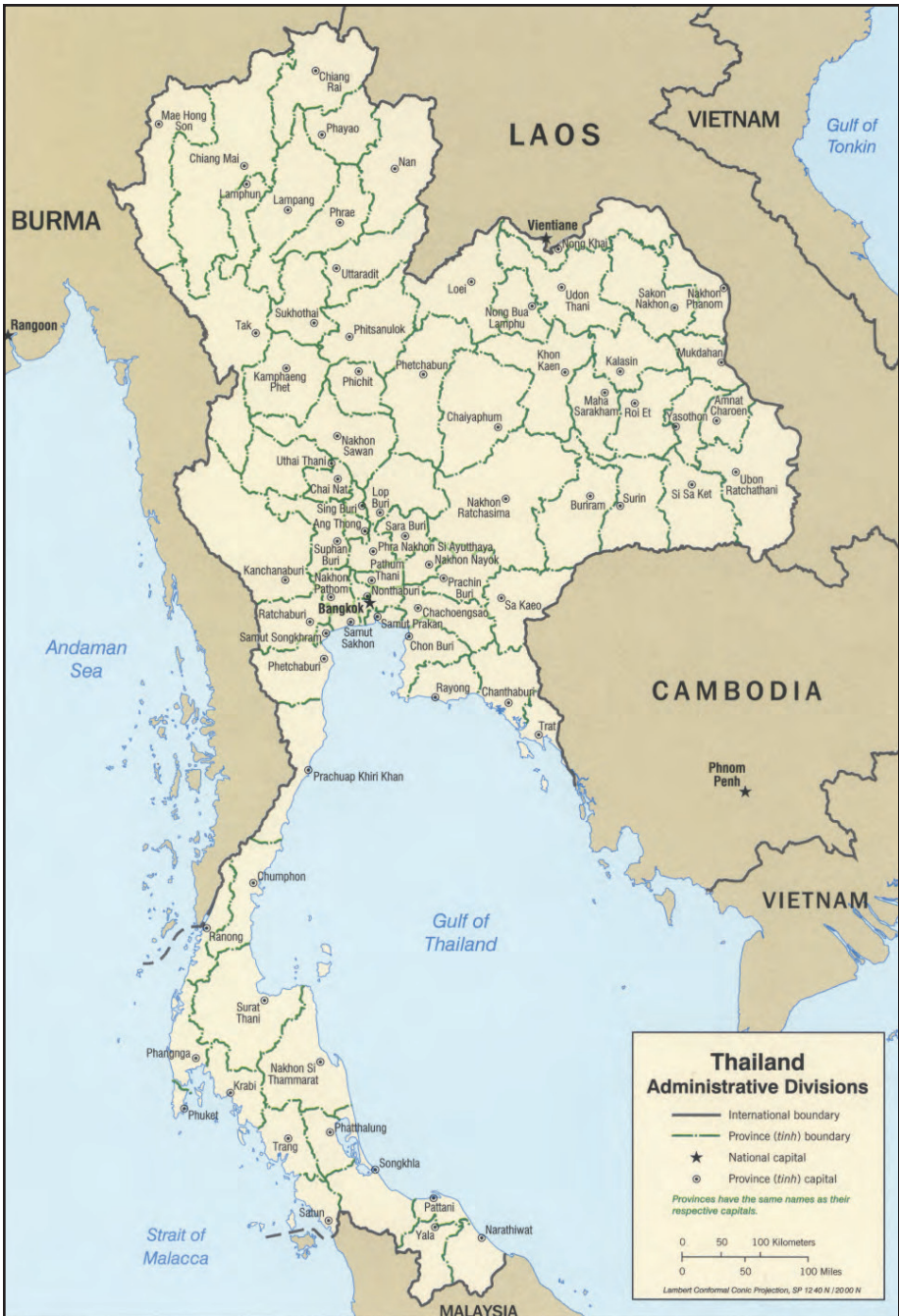
Map of Thailand.