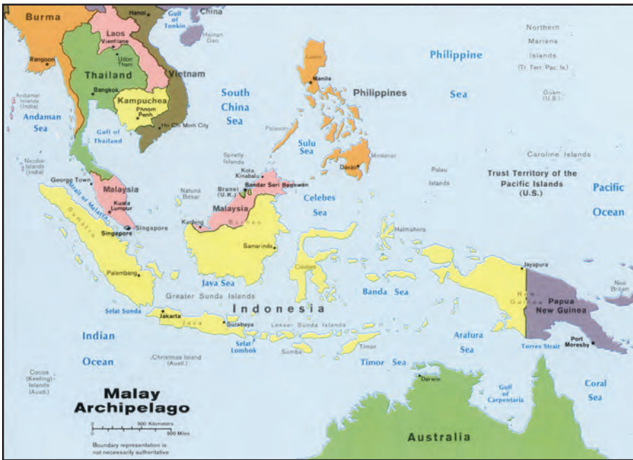
The Malay Archipelago, a region more commonly known as Southeast Asia.