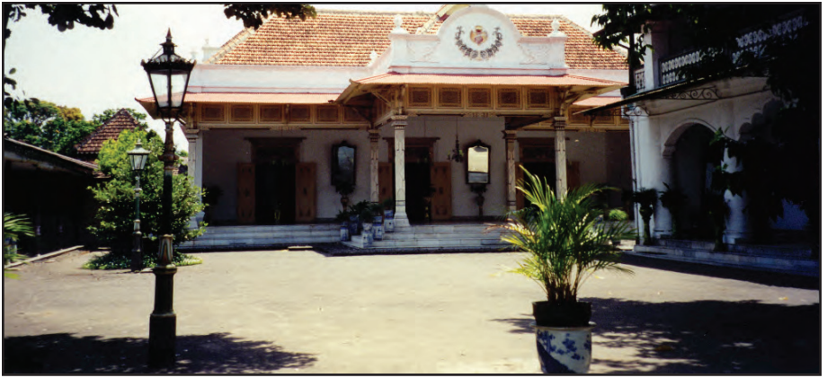
Sultan's palace in Jogjakarta, Java, Indonesia, September 2000.