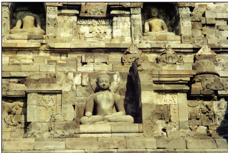
Close-up view of Borobuder Buddhist Temple in Yogyakarta, Java, Indonesia, September 2000.