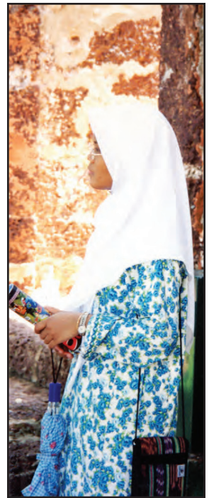
Muslim woman dressed in traditional garb, Malacca, Malaysia, May 2001.

Very quickly after the co-optation of Anwar Ibrahim into the UMNO, a number of measures aimed at strengthening Islamic values in Malaysian society began to be implemented. Among these were the establishment of an Islamic bank, the International Islamic University of Malaysia (IIUM), 57 an Islamic insurance company, a network of Islamic pawn shops, a ban on gambling, a ban on the import of beef not slaughtered in accordance with Islamic rules, greatly increased Islamic content on radio and television, introduction of Arabic script ( jawi ) into the primary school curriculum, the suspension of the government-run meal program in public primary schools during the month of fasting ( Ramadan ), mandatory teaching of Islam both in elementary schools and in institutions of higher learning, a ban on smoking in all government offices, and training courses on