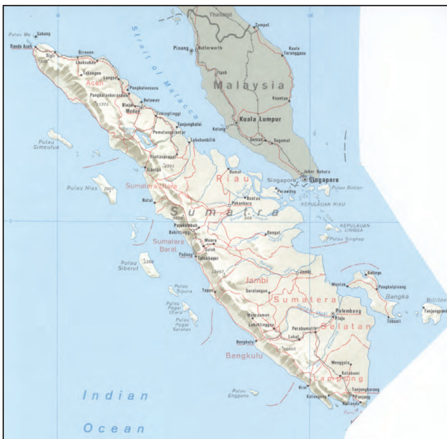
Map of Sumatra indicating the Aceh region of Indonesia.