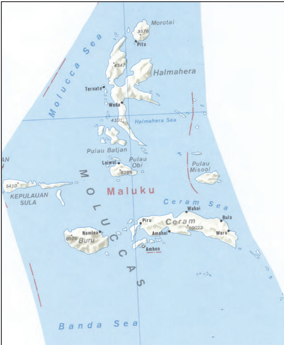
Map of the group of Indonesian islands known as Maluku.