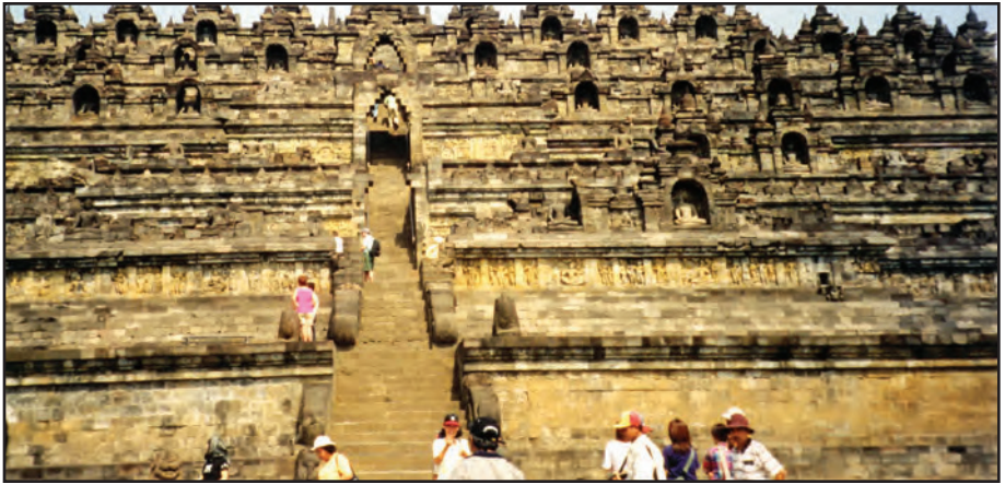
View from the base of Borobuder Temple in Yogyakarta, Java, Indonesia, September 2000.