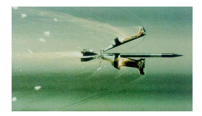
Figure 3: A representation of the final stage of sabot separation from the penetrator.<sup>59</sup>

Arsenal and BRL also produced a series of designs for the sabot focusing on exact shape of the scoops or ramps. The final double ramp sabot shape used on the M829 was the result of computer modeling by BRL.<sup>60</sup>