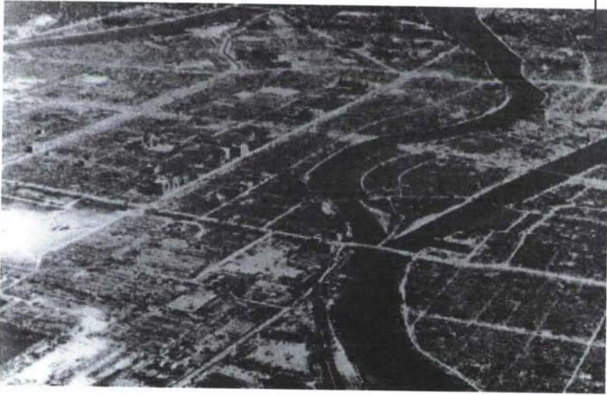
Ground zero at Hiroshima

aroused U.S. optimism “for an early termination of the war.” On the other hand, a protracting list of casualties would contribute “to decreased fighting morale among the [American] people and the military.” With U.S. resolve so brittle, the Japanese Army reasoned that a climactic battle on the beaches would force America to make a compromise peace. That was the strategic setting on 6 August, when one specially modified B-29 took off from the Marianas to test the JCS assumption that, individuals notwithstanding, Japan “as a whole is not pre-disposed toward national suicide.” The plane dropped a weapon on Hiroshima that, according to Japanese newspapers, “ignored basic human principles.” 57