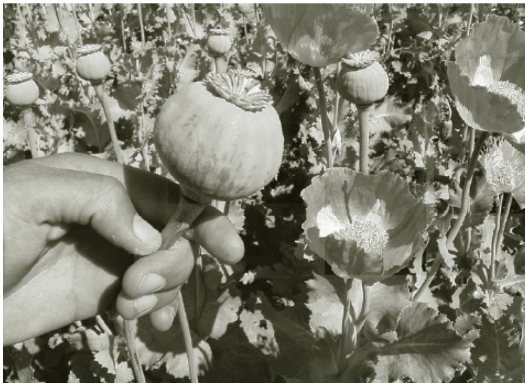
Figure 1. Opium Poppy Capsule. 11

Opium poppy is a hardy, drought-resistant plant easily grown in most parts of Afghanistan, with a growing cycle that conveniently spreads the farmer's workload throughout the year. Opium poppy is usually planted between September and December and flowers after approximately 3 months. The flower's petals then fall away, leaving the plant's seed capsule containing an opaque, milky sap known as opium (see Figure 1). Harvested between April and July, the plump seed capsules are then lanced, allowing the opium sap to ooze out for collection after it has dried into a black tar-like substance. The opium sap is then refined into opiate-based products.