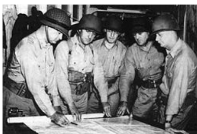
Left to right: MajGen Alexander Vandegrift, command officer; LtCol Gerald C. Thomas, operations officer; LtCol Randolph McC. Pate, logistic officer; LtCol Frank G. Goettge, intelligence officer; and Col William Capers James, chief of staff.