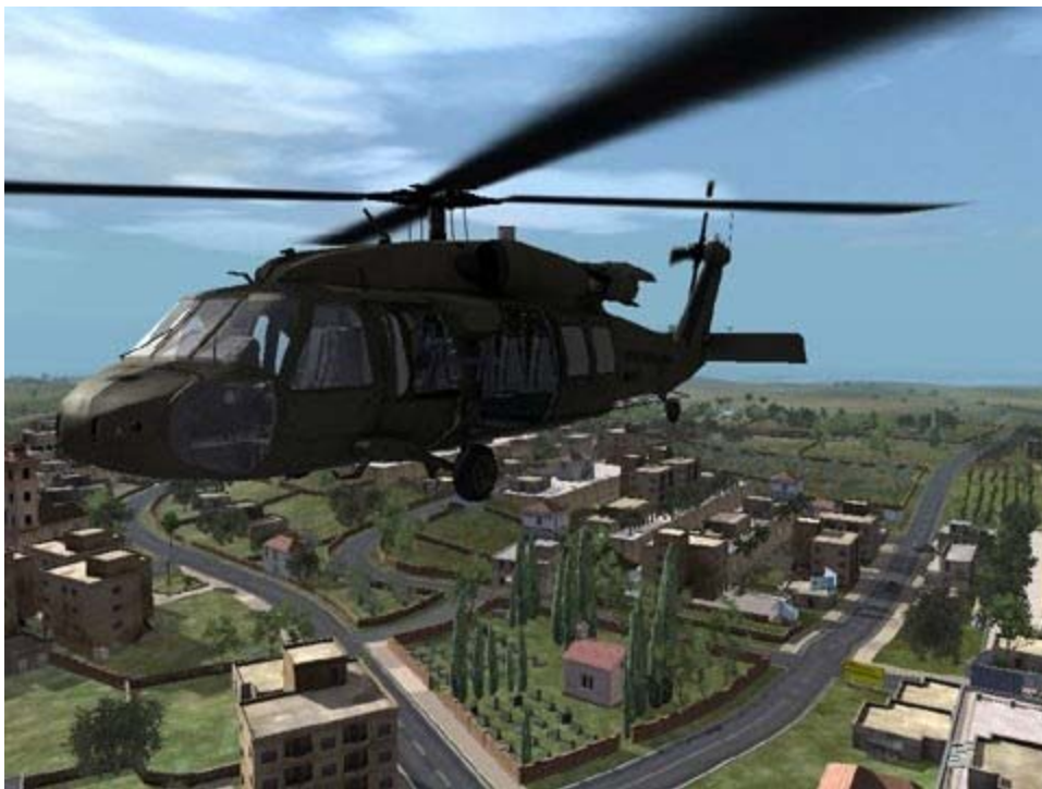
Figure 3. Screenshot of Armed Assault™.

OFP/VBS1/DAR-AM exist as a testament to the performance of the Real Virtuality™ engine—A seven-year-old engine! Currently, game engines allow for much more building and subterranean realism, though most lack the total package found in OFP's engine. Fortunately, Bohemia Interactive released an update to the engine in February 2007, though that arrived too late for this study (See Figure 3). Nevertheless, in each area that VBS1 scored weak, there exist games and simulations that perform relatively well. How well each system scored with regard to the recommended requirements in Table 1 will be discussed later in this chapter.