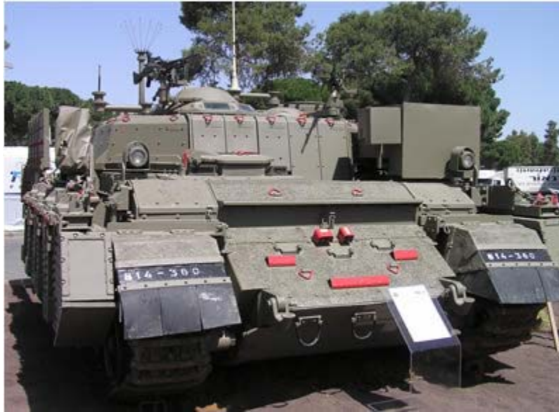
Figure 1 Nakpadon APC 35

The IDF used much of their new tactics from Lebanon in the occupied territories of the West Bank and the Gaza Strip. Due to the losses incurred by the IDF mechanized infantry riding in M113 light APCs, the IDF developed heavy APCs to counter the threats that destroyed the lighter Israeli APCs. The IDF began to use its heavy APCs together with its tanks to perform ballistic breaches into walled compounds using tank guns and demolition charges in order to insert troops into PLO buildings.