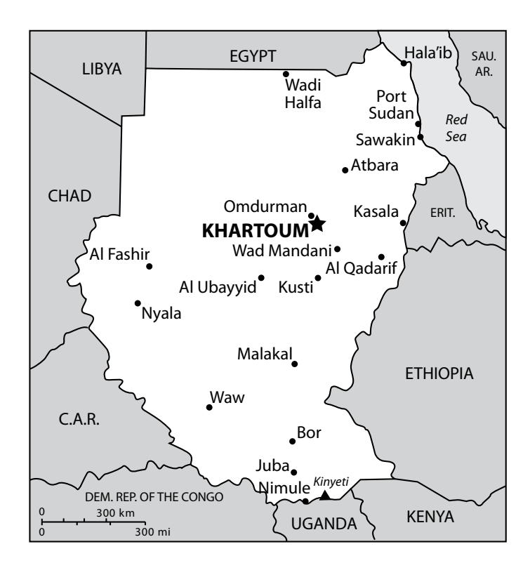
Figure 3. Map of Sudan . (Reprinted from General Libraries, University of Texas, 18 March 2002, http://www.lib.utexas.edu/maps/cia02/sudan_sm02.gif.)

Several Islamic entities supported al-Turabi, who headed Sudan's National Islamic Front (NIF).<sup>25</sup> For example, Iran sent political specialists, while Iraq sent military officers.<sup>26</sup> Osama bin Laden was introduced to the NIF by the Iranians and lived in Khartoum (fig. 3) from 1991 to 1996.<sup>27</sup>