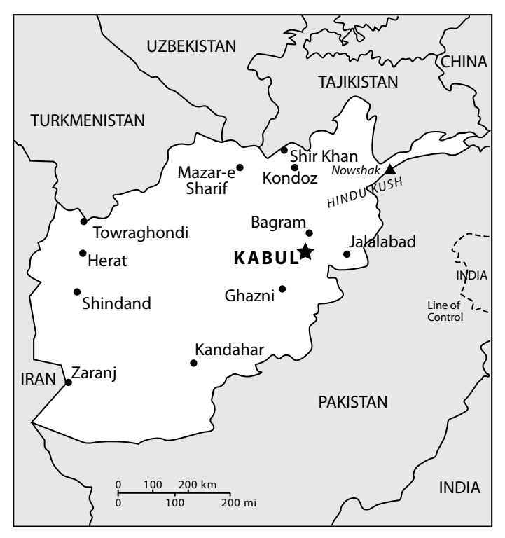
Figure 2. Map of Afghanistan .

bus bombing in Egypt that killed nine German tourists.<sup>22</sup> Other attacks that did not materialize during this time period were plots to assassinate Pope John Paul and to blow up six US 747s over the Pacific.<sup>23</sup>