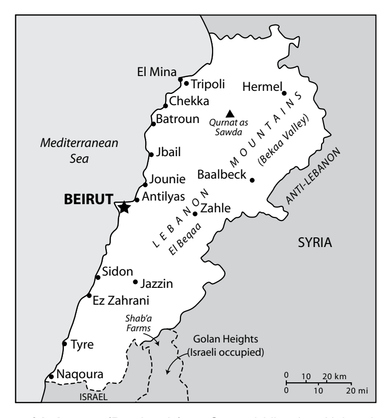
Figure 4. Map of Lebanon . (Reprinted from General Libraries, University of Texas, 18 March 2002, http://www.lib.utexas.edu/maps/cia02/lebanon_sm02.gif.)

blasted the government for being soft on the PLO and decided to invade Lebanon and engage the PLO directly.<sup>7</sup>