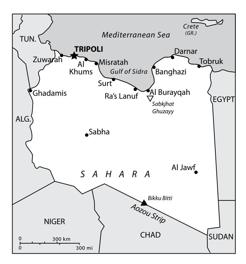
Figure 1. Map of Libya.

"line of death" (see fig. 1), Weinberger "concluded that we would have to ignore these claims, and continue planned exercises for that region."6 On the night of 18 August 1981, Libyan SU-22 fighters engaged two US Navy F-14s that were below the line of death and were promptly shot down.<sup>7</sup> Tensions continued to rise until 1986 when the US Navy began its 19th exercise in the area since 1981. It was the eighth time that American forces would operate below the 32 degrees 30 minutes line.8 On 24 March portions of the US Navy's Task Force 60, under the command of Vice Adm Frank B. Kelso, crossed Gadhafi's line of death. This time Gadhafi chose to defend his claimed territory in earnest. When the US Navy decided to depart above the line of death three days later, it left behind several sunken Libyan warships, as well as one destroyed SA-5 missile battery. 10 President Reagan reminded the world that "the American exercises in the Gulf of Sidra were standard procedure. So it wasn't an unusual thing we set out to do. And he did open hostilities and we closed them."11 Says Weinberger, "Qaddafi now turned to the use of terrorism to try to secure some advantage and escape from the continued humiliation he suffered as the world perceived how idle were his threats, and unequal his courage, for taking any military action to match his words."12