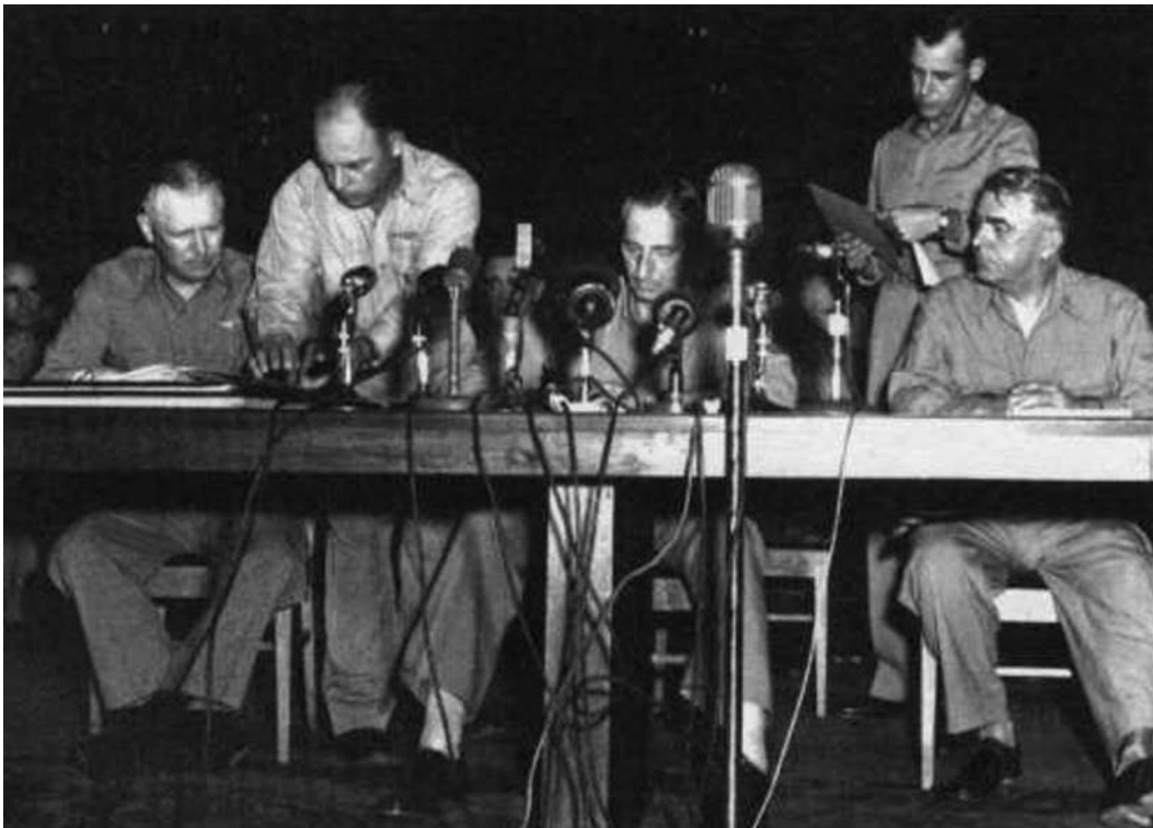
Center, Gen Mark W. Clark, signs the armistice agreement; left to right: General Weyland and Vice Adm Robert P. Briscoe, NAVFE commander.