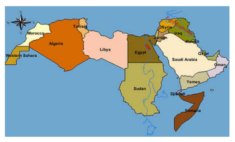
Figure 1: Arabic-speaking Nation States<sup>17</sup>

The fact that the Arabic language is the liturgical language of Islam worldwide adds another dimension to our study. While it is certainly not true to say that all Muslims in the world speak Arabic, one can assert the following. In accordance with Qur'anic scriptures and the authority of four major Islamic schools of thought, one must speak and read classical Arabic in order to fully understand and teach the religion of Islam. Even in countries where Arabic is not the common spoken tongue, non-Arabic speaking Muslims pray in Arabic, and simply submit to the desires of their Arabic speaking clergy. <sup>18</sup> This paper will explore the relationship between Arabic and Islam in further detail, but the evidence presented to this point indicates that for approximately 1.5 billion people worldwide, the Arabic language has some impact on their culture. <sup>19</sup>