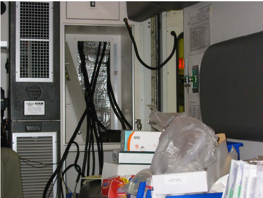
Figure 3. In-Process LifeLink Equipment Install-Forward Bulkhead