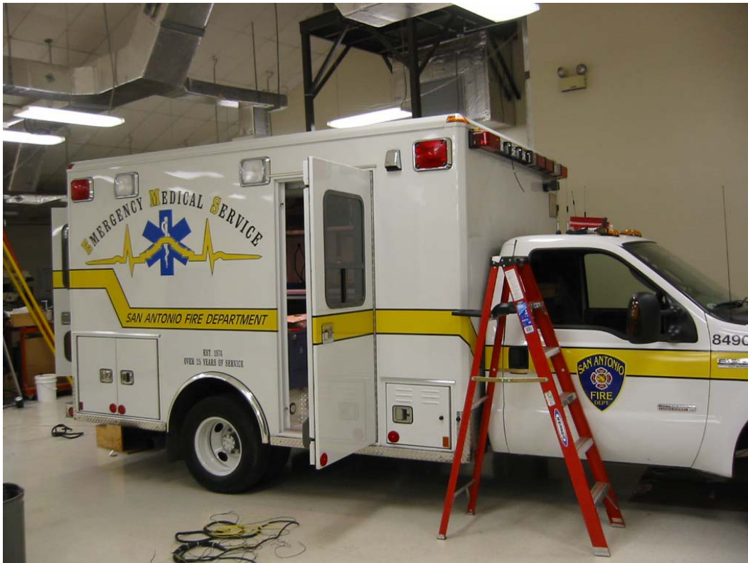
Figure 1. Ambulance in LifeLink Lab at SwRI during Upgrade

Gaining access to an active ambulance for upgrade required that the subject ambulance be removed from active service and replaced with a backup vehicle including movement of active operational and patient care equipment to the backup ambulance. Installation of LifeLink equipment involved significant disassembly and technical preparation of each ambulance, including routing of cabling and installing antennas. This work was followed by re-assembly of the ambulance and test of the installed system. Once the upgrade was completed, the ambulance could be returned to SAFD EMS for re-configuration and acceptance for return-to-service. Snapshots of the project ambulances during typical LifeLink equipment installations are presented in Figures 1 through 4 for reference.