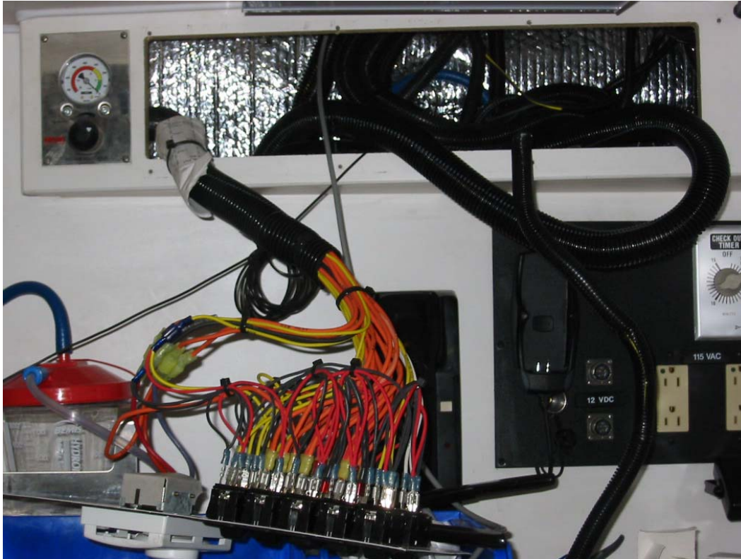
Figure 4. In-Process LifeLink Equipment Install-Headseat Area

SwRI and SAFD coordinated access to the five project ambulances, and installation, test of LifeLink equipment, and return-to-service for the five ambulances was accomplished in the March through May 2006 timeframe. The unique SAFD EMS identification numbers for the five project ambulances and the dates of return-to-service are presented in Table 1.