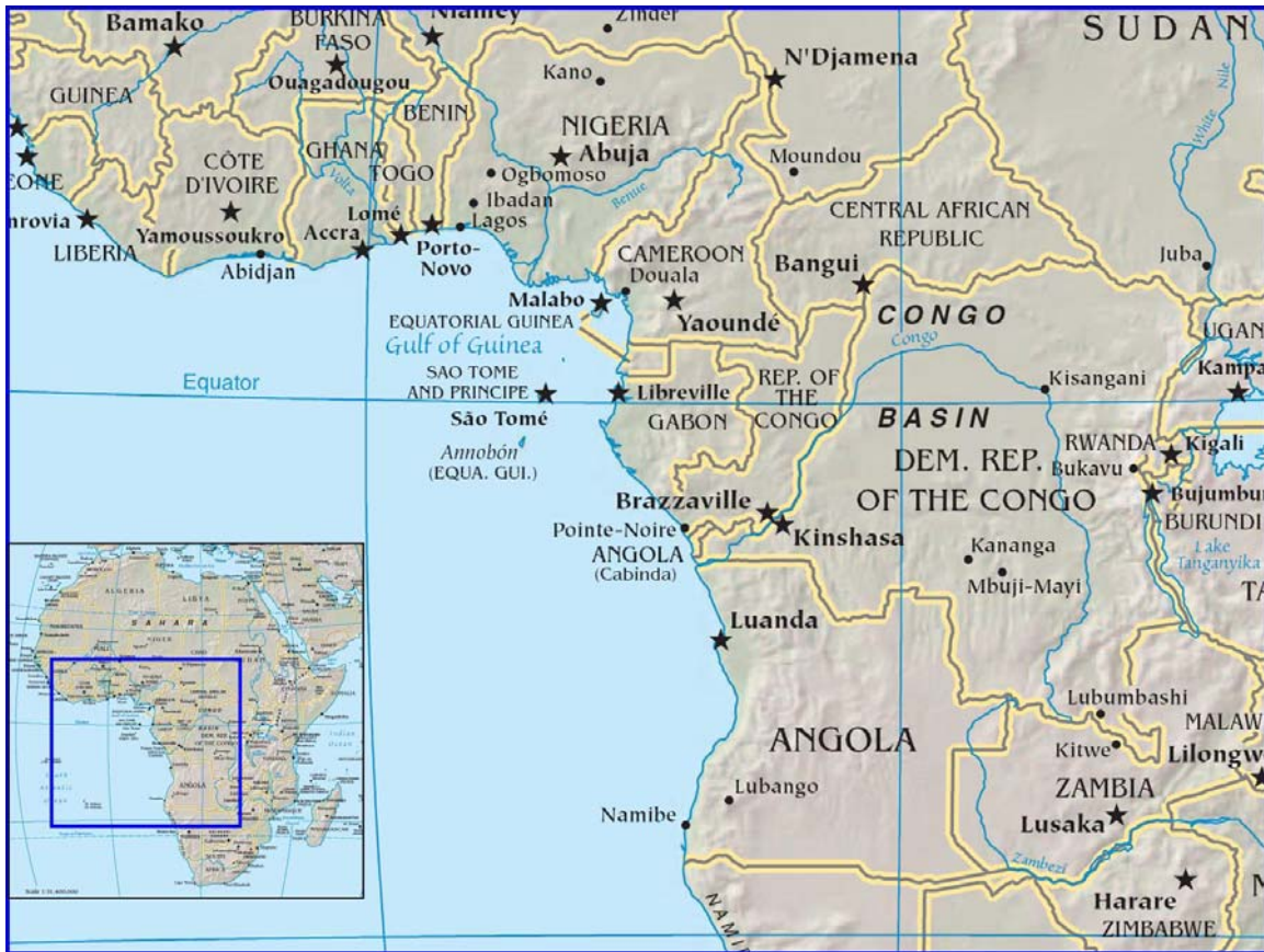
Figure 1. Map of the Gulf of Guinea Region in Central West Africa [After Perry-Casteneda 2006]

By 2006, GOG countries made great strides to improve maritime safety and security in the region. A first step was their participation in a EUCOM-sponsored workshop in Accra, Ghana in early 2006. This set the stage for the “Communiqué of the Gulf of Guinea”. This Communiqué or letter of intention was agreed upon in November 2006 at the Maritime Safety and Security Conference in Cotonou, Benin. The ministers and representatives of these nations agreed to improve MDA, implement legal and regulatory frameworks, sub-regional cooperation, and improve public awareness and political will to the benefit of maritime safety and security. The GOG countries’ leadership urges greater collaboration to strengthen the relation with EUCOM and CNE-C6F [Gulf of Guinea Maritime Safety and Security Ministerial Conference 2006]. The door is open for increased engagement.