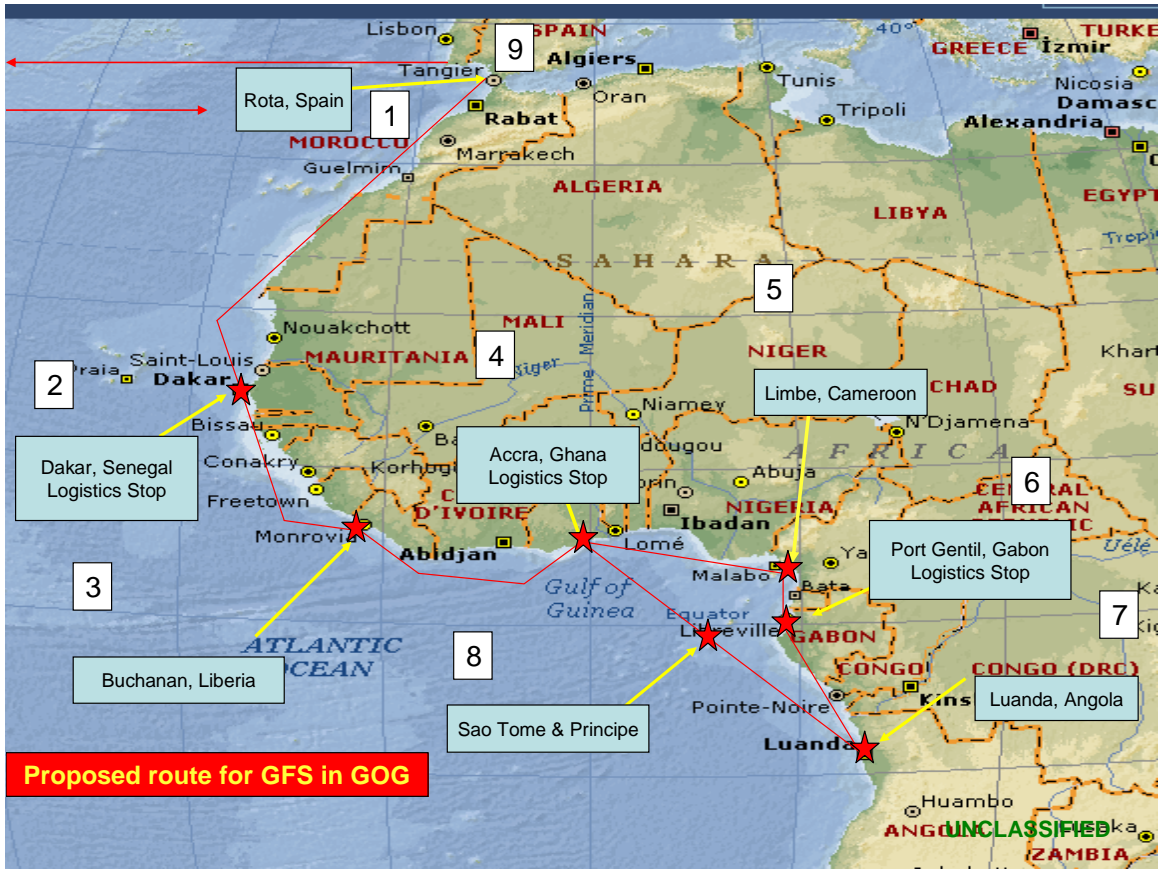
Figure 3. Proposed 2007 GOG GFS Demonstration route [After Fulkerson 2007-B]

The missions assigned to the countries are those designated by CNE-C6F (see Table 1). Only the countries set to provide logistics support as shown in Figure 3 (Senegal, Ghana, and Gabon) are designated to provide provisions, although USN has contracts in place to get fuel from other countries like Angola and STP if needed.