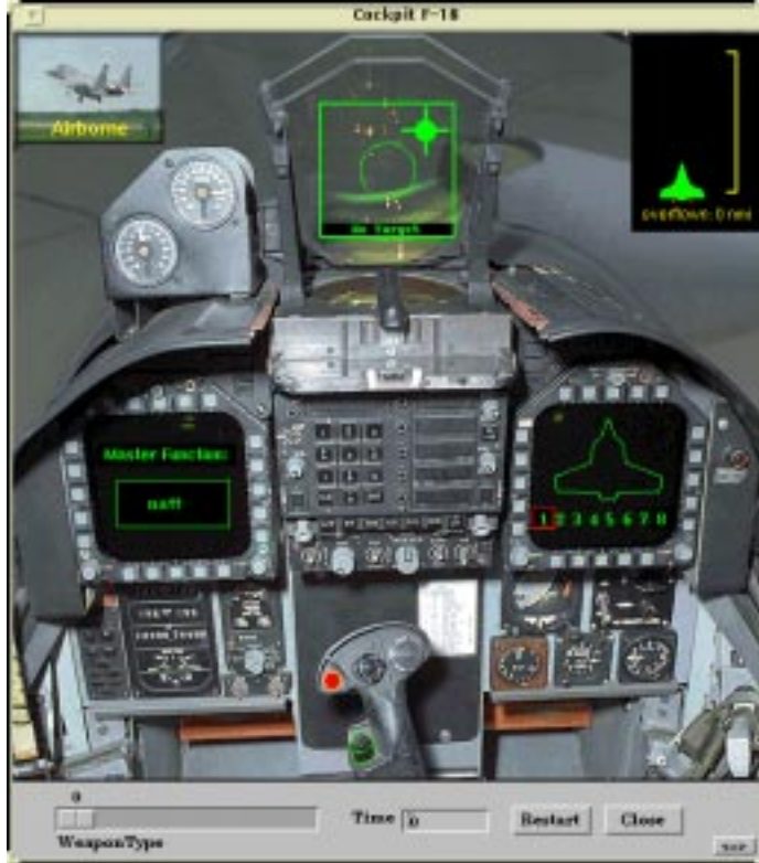
Fig. 2. Customized simulator front-end for an attack aircraft specification

The number of reachable states in a state machine model of real-world software is usually very large, sometimes infinite. To make model checking practical, we have developed sound methods for deriving abstractions from SCR specifications [3]. The methods are practical: none requires ingenuity on the user's part, and each derives a smaller, more abstract model automatically. Based on the property to be analyzed, these methods eliminate irrelevant variables as well as unneeded detail from the specification. For example, prior to invoking Spin to check the WCP specification for a safety property, we used our abstraction methods to automatically reduce the number of variables from 258 to 55 and to replace several real-valued variables with finite-valued variables, thus making model checking feasible [10].