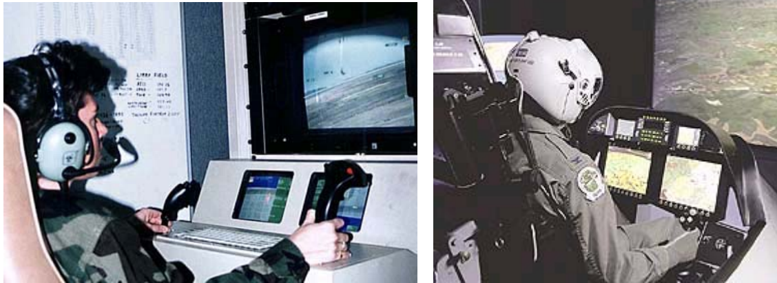
Figure 3: Predator Remote Pilot Station, Joint Strike Fighter Cockpit Simulator.