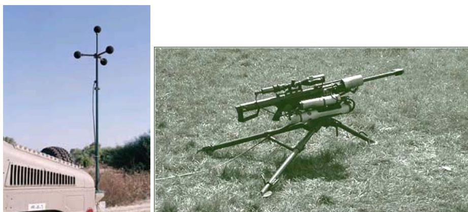
Figure 2: Notional Automated Counter-Sniping System.

The challenge to conceptual systems like these is, therefore, in their capacity to discriminate – not in their capacity for automated action.