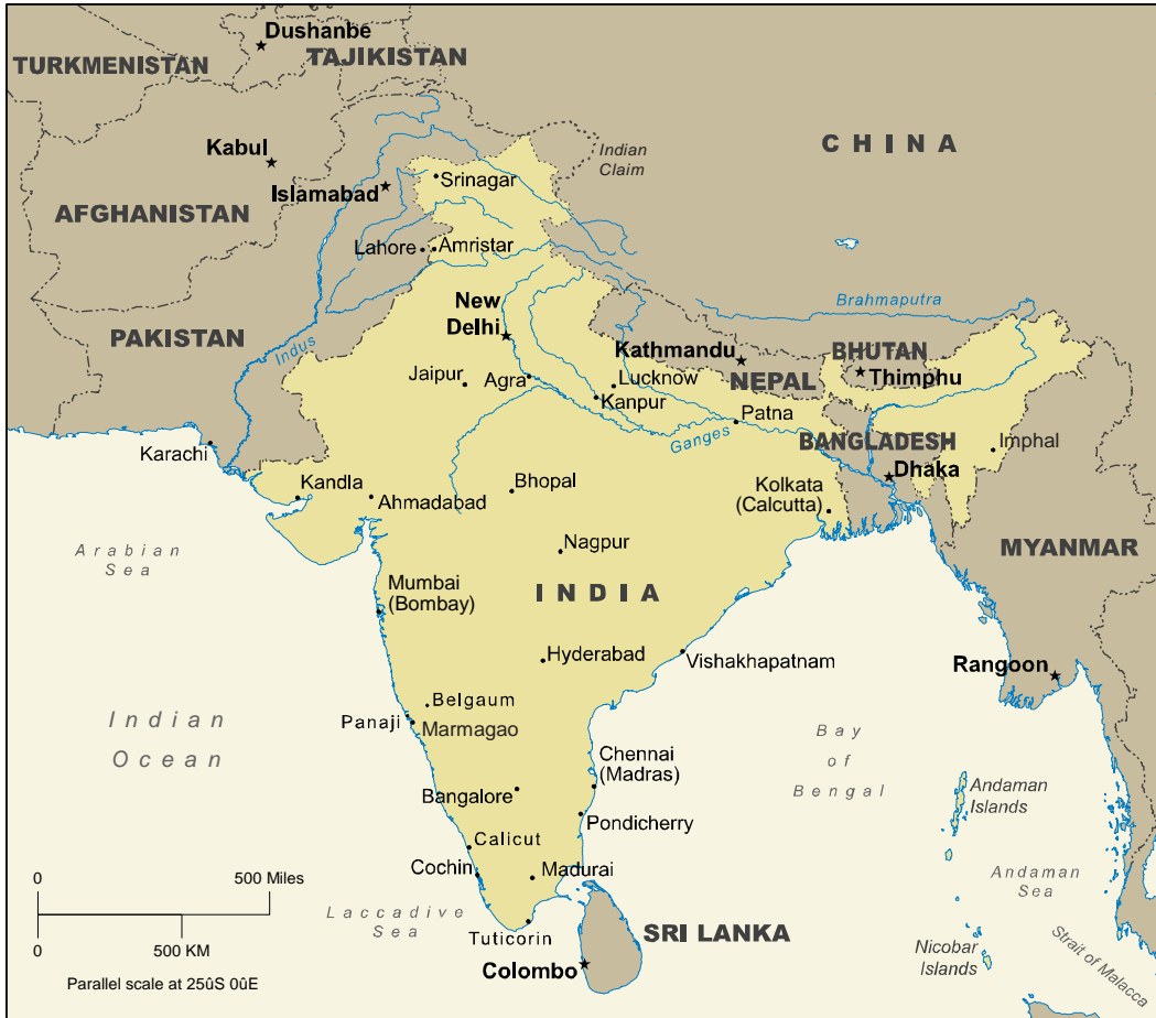
Figure 2. Map of India