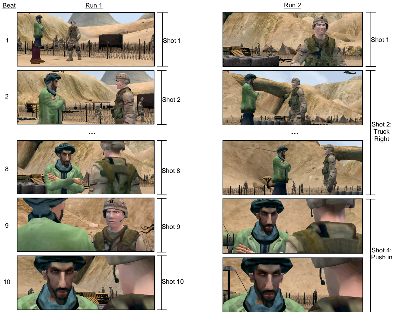
Figure 6. Cambot screenshots: two runs of the same scene using different heuristics.

The next search phase considers each beat independently. Cambot compiles a list of all the shots that are compatible with the previously selected stage and blocking. It evaluates the shots according to the given view constraints. Cambot uses dynamic programming to search for the sequence of shots (i.e., the reel) that best covers the beats in a scene. This technique reduces an exponential search space of shots – given n beats and m shots available, there are m^n possible scenes – to polynomial time, O(mn) . This assumes that the property of optimal substructure holds for reel selection: that the optimal solution to a large problem contains within it the optimal solutions to the smaller sub-problems on which it is built.