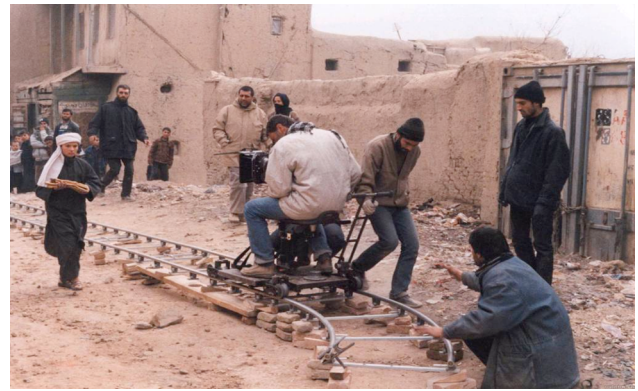
Figure 2. The capturing of a cinematic shot requires coordination between actor and camera placement.

For example, Figure 2 shows a set during the filming of a shot; in this case, the movements of the camera and the character are closely coordinated so that the former leads the latter down the street. In order to achieve this shot, it was necessary for the director to select a location with sufficient space for the actor and camera to move, and to