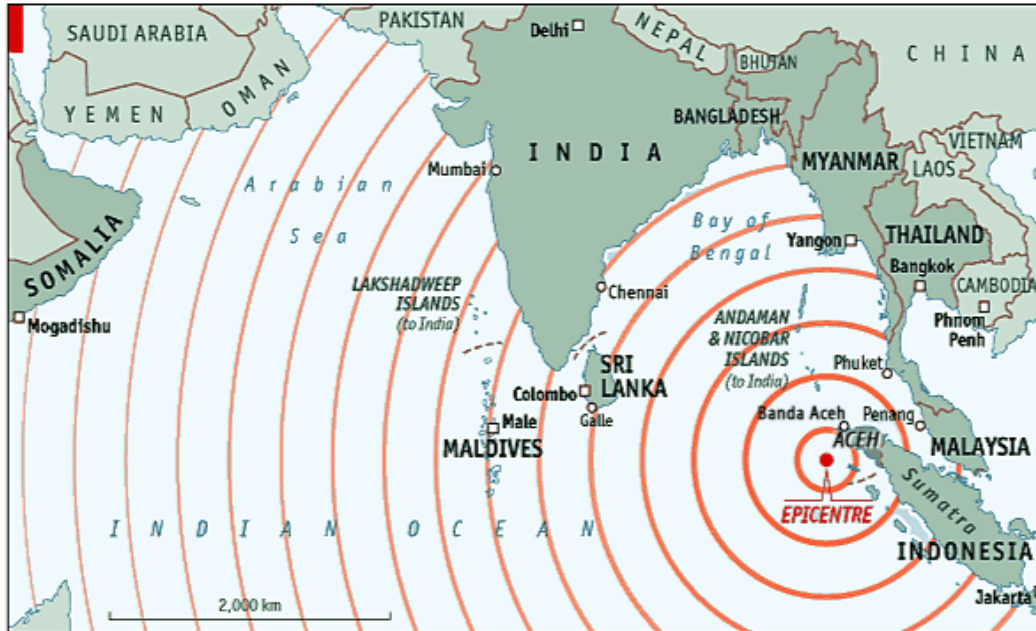
Figure 1. Map of the 2004 Indian Ocean Earthquake and Tsunami