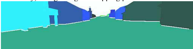
Figure 2: Detecting the edges in the urban scene

The basic idea behind Yeap's theory of cognitive maps (Yeap 1988) is to build a representation of the open space around the viewer. As previously mentioned this space is defined by the boundaries and exits that surround the viewer. The key to Yeap's construction of a raw cognitive map is the identification of the exits, which are defined as gaps between obstacles. This is the commonsense definition of an exit. But how does one compute it? We need to start by looking for gaps in the surfaces surrounding the viewer, beginning by looking for occluded edges. An exit is a way of leaving a local space. It is also a signal to compute a new ASR. Exits serve another important purpose in that they identify places in the space that have not been uncovered yet. These are places that are occluded and the viewer is not sure of. It may not actually be an exit, merely a place that has not been explored yet. If the goal is to build a complete raw cognitive map of an area, then the exits may actually be areas one needs to explore more fully, thus guiding the mapping process.