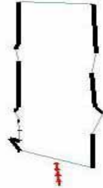
Figure 3: This is a top-down perspective of an ASR of the street scene from Figure 1. The building boundaries are shown as dark lines and the doubtless exits as thin lines. The viewer's path is shown with arrows. There are no doubtful exits in this ASR.

Since the viewer's perspective changes over time the ASR must continually be updated. Even a simple shift in gaze will uncover more details about the environment. Moving through the environment will cause some occlusions to be uncovered and others to be formed, so the question is how to incorporate this information into the raw cognitive map.