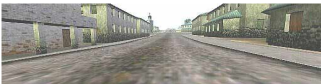
Figure 1: View of a street in a virtual urban environment