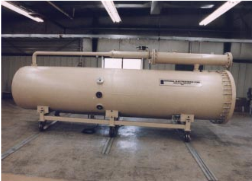
Figure 1: The 3 MeV tandem electrostatic accelerator built by NEC

charge per micropulse and a micropulse length of 5 ps. The laser photocathode operates at 142.8 MHz, the beam emittance is estimated to be 2.7–10 mm-mrad, and the energy spread can be as low as 0.1% depending on the pulse length. A schematic of a 2\frac{1}{2} -cell, S-band RFG with a laser photocathode capable of producing a 6 MeV, high-brightness electron beam, is shown in Fig. 2. The beam from such an RFG, coupled to a QOG-powered wiggler, gives rise to the possibility of a RFG-powered IR FEL with a smaller footprint and reduced shielding compared to existing systems.