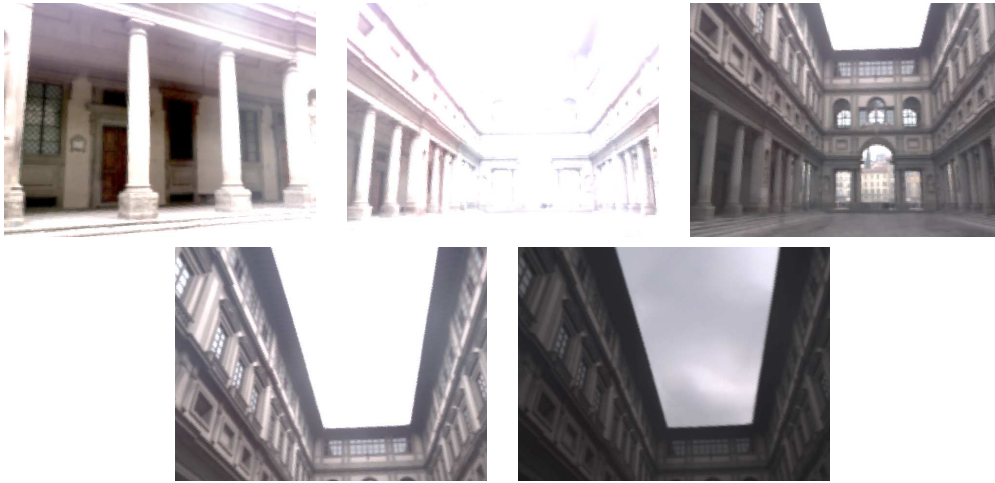
Fig. 2. Screen snapshots from our high-dynamic range panorama viewer. The viewer implements our HDRTM technique allowing these results to be rendered interactively at 50 Hertz at 640 \times 480 pixels with 4x antialiasing. The exposure changes by a factor of 100 over these 5 images.