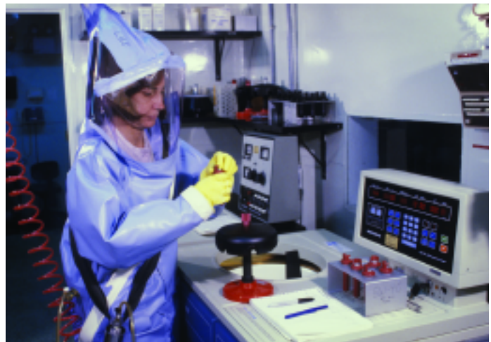
A CDC scientist conducts laboratory research in the Biosafety Level 4 laboratory, Atlanta, GA.

are organizing the Interagency Modeling and Atmospheric Analysis Center (IMAAC) to provide a single point for the coordination and dissemination of atmospheric dispersion modeling and other atmospheric hazard prediction products for incidents of national significance. These predictions will be disseminated to Federal, state, and local responders.