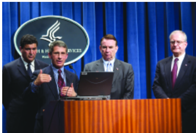
HHS Secretary Thompson (third from left) and Zerhouni, Fauci, and Marburger (left to right) announce the creation of the NSABB.