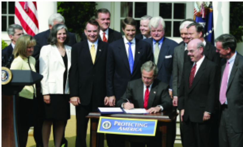
President George W. Bush signs S.15, the Project BioShield Act of 2004 in the Rose Garden, July 21, 2004. Ceremony Participants include, front row from left, Frances “Fran” Townsend, Dr. Julie Gerberding, Sec. Tommy Thompson, Sen. Bill Frist, Sen. Ted Kennedy, Sen. Thad Cochran, Rep. Chris Cox, Rep. Henry Waxman, Sen. Judd Gregg, 2nd row from left, Dr. Anthony Fauci, House Speaker Dennis Hastert, Sec. Tom Ridge, Rep. Joe Barton.

In the remaining sections, the details of accomplishments and on-going activities are provided, first concerning defense against catastrophic threats arising from chemical, biological, radiological, or nuclear weapons, and in the following section focusing on the remaining priority S&T initiatives. Although by no means exhaustive, these examples typify the progress that has been made in the key research areas designated as priority goals by this Administration in the National Strategy .