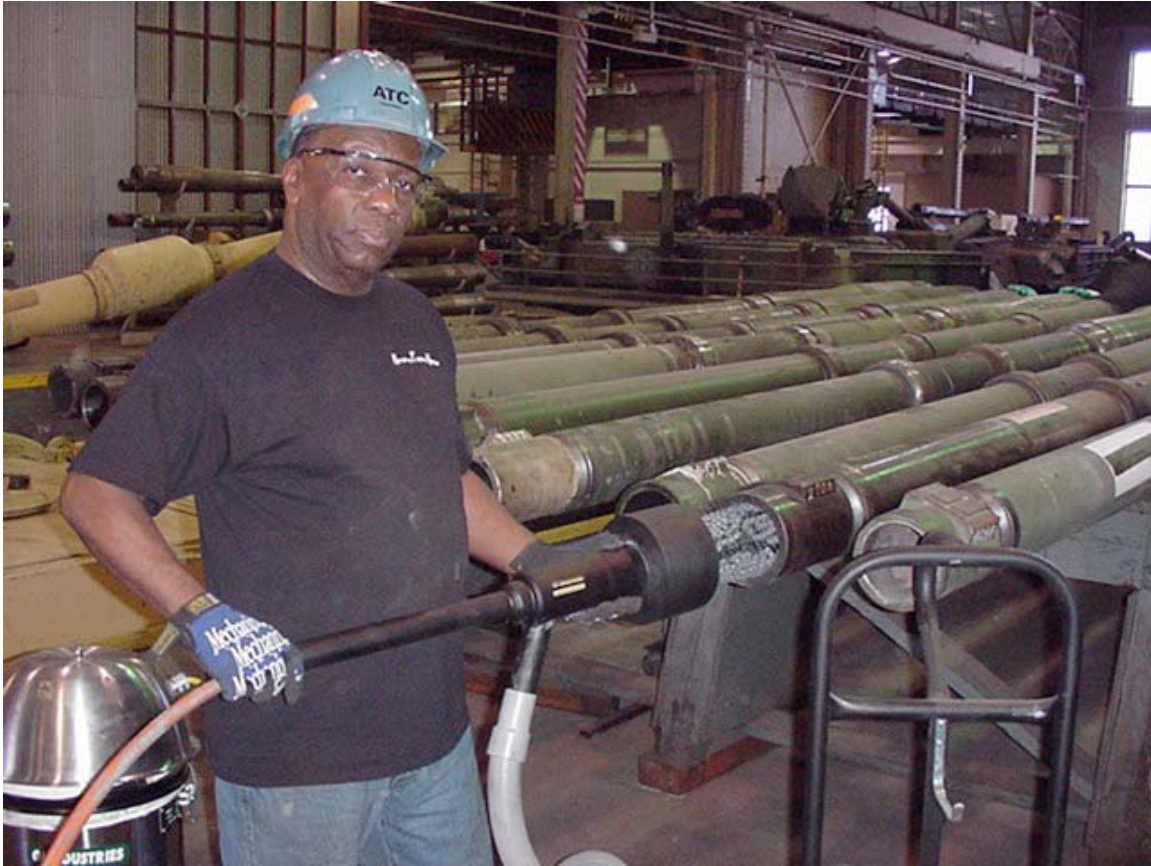
Figure 2. Vacuum fixture designed to remove abraded brush and bore surface residue during cleaning.