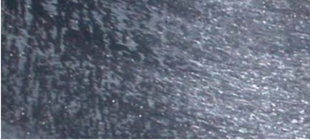
Figure 3. Surface finish appearance after SBCD cleaning.