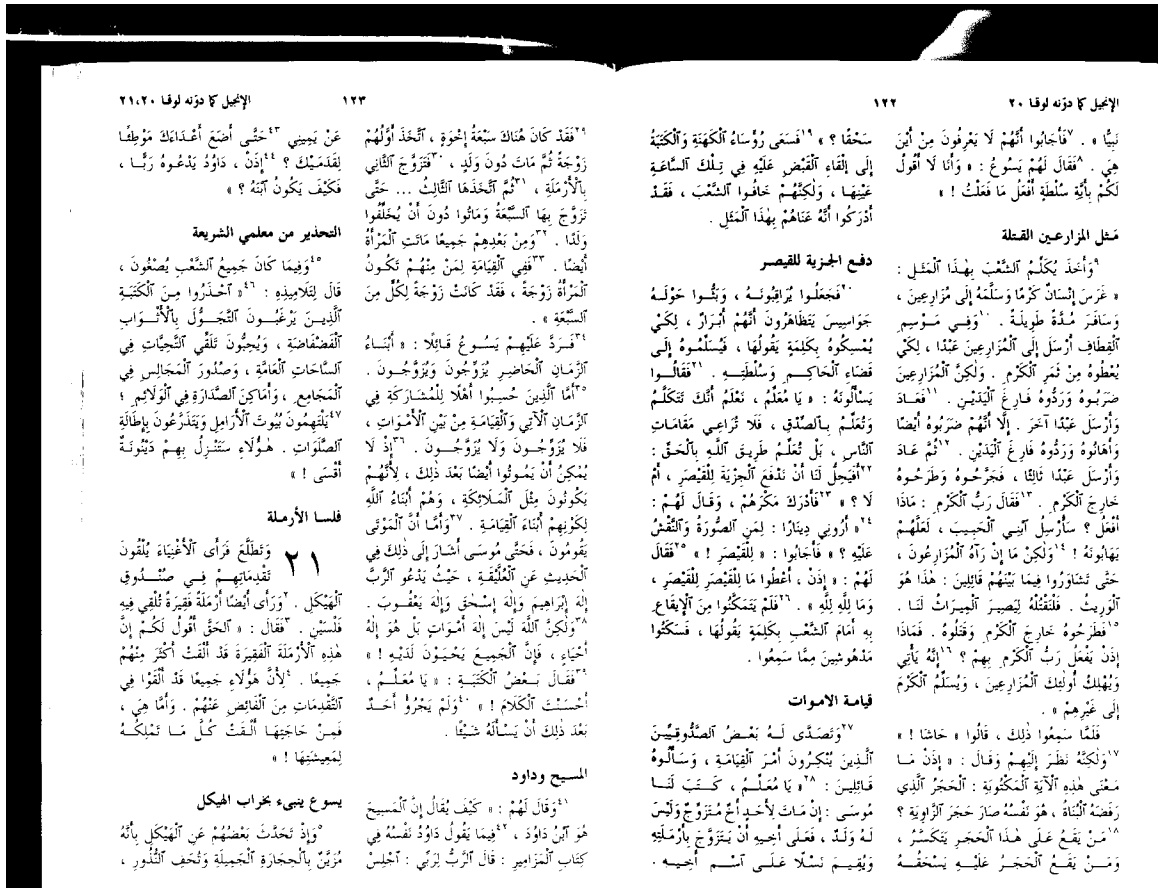
Figure 1: Scanned image of an Arabic Bible page.

In Figure 1 we show a binary scanned image from the Arabic Bible. Manually delineated zones for this image are shown in Figure 2. The zones are non-overlapping rectangles and are ordered in Arabic reading order. A section of the zone groundtruth file storing the attributes of a zone is shown in Figure 3. The details of the database design, file formats, directory structures, etc. is available in a separate article [KKB98].