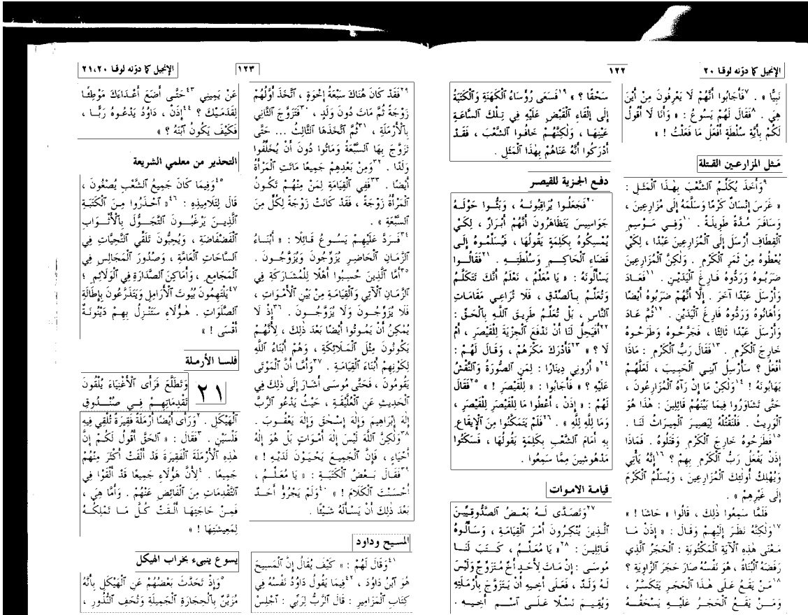
Figure 2: Zone groundtruth for the scanned image shown in Figure 1. Notice that the zones are rectangular and non-overlapping. The zones were created using the PinkPanther groundtruthing tool[YV98, RV94].