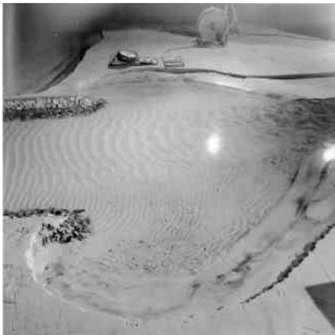
Figure 3. Idealized inlet model with sand bed showing erosion at shoreline terminus of intersection of jetties with beach

The inlet facility is adaptable for a variety of studies. In its existing “idealized” state, it can be used to study basic concepts in a generic manner. For example, if changes were proposed for the location-orientation of channels converging from the bay into the main inlet channel exiting to the ocean, measurements to determine change in flow distribution in the inlet gorge and ebb channel could be quickly performed. In its sedimentary mode, i.e., with a thick layer of 0.13-mm sand placed over the fixed bed and molded to any desired bathymetry, channel equilibrium areas were generated to determine the minimum cross section. Also, inner-bank erosion and the creation of an embayment behind the intersection of a jetty and the shoreline have been examined, as seen in Figure 3. Direction of sand spit development and encroachment on a channel was studied generically.