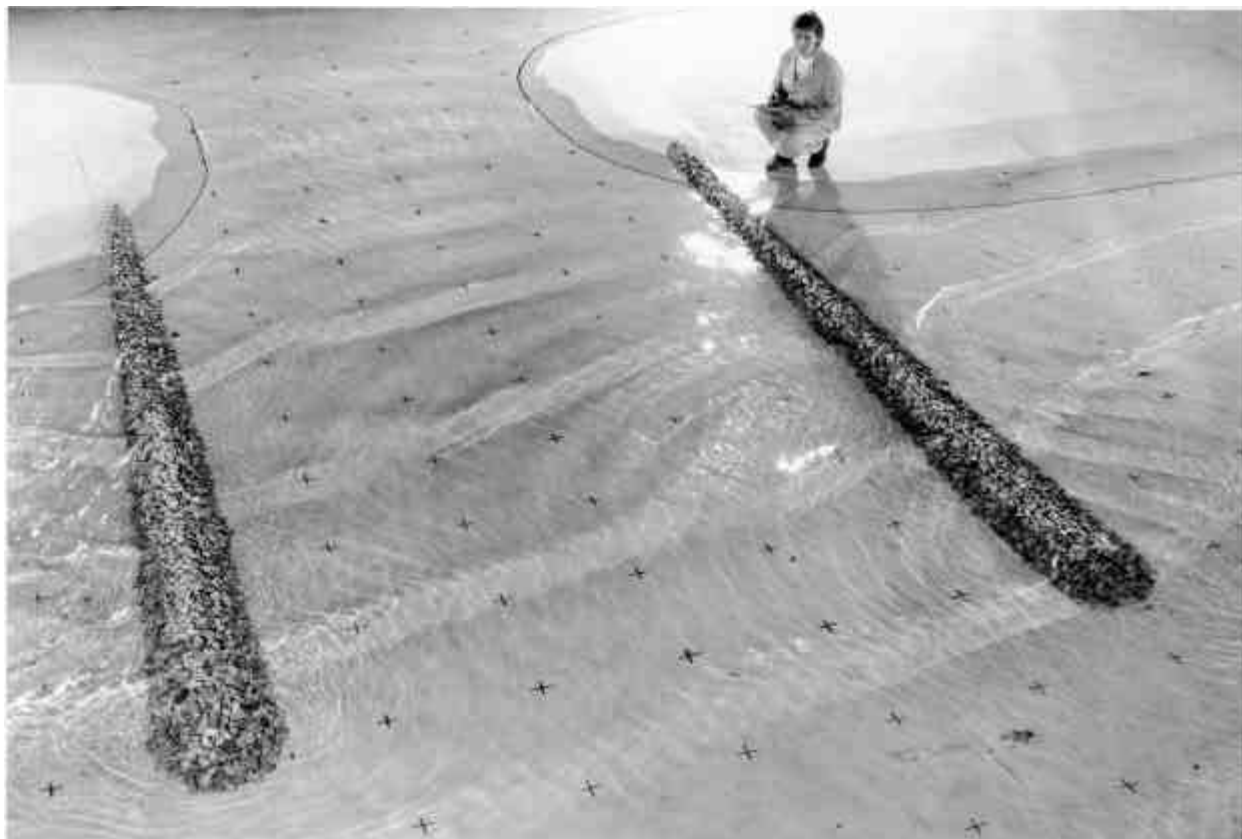
Figure 2. Idealized inlet entrance channel