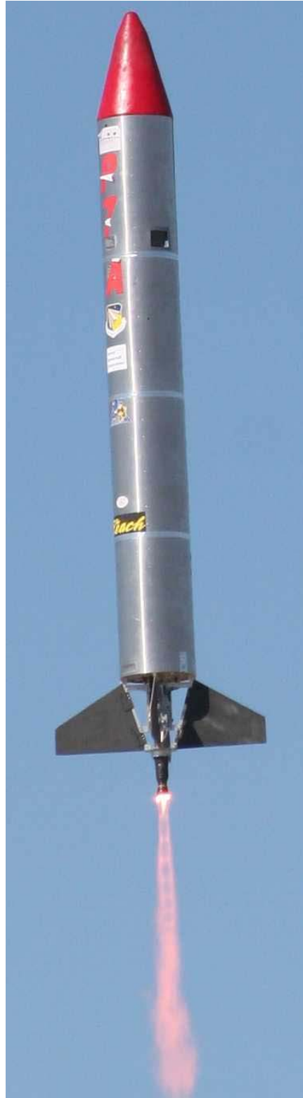
Figure 8. First Flight of the Day