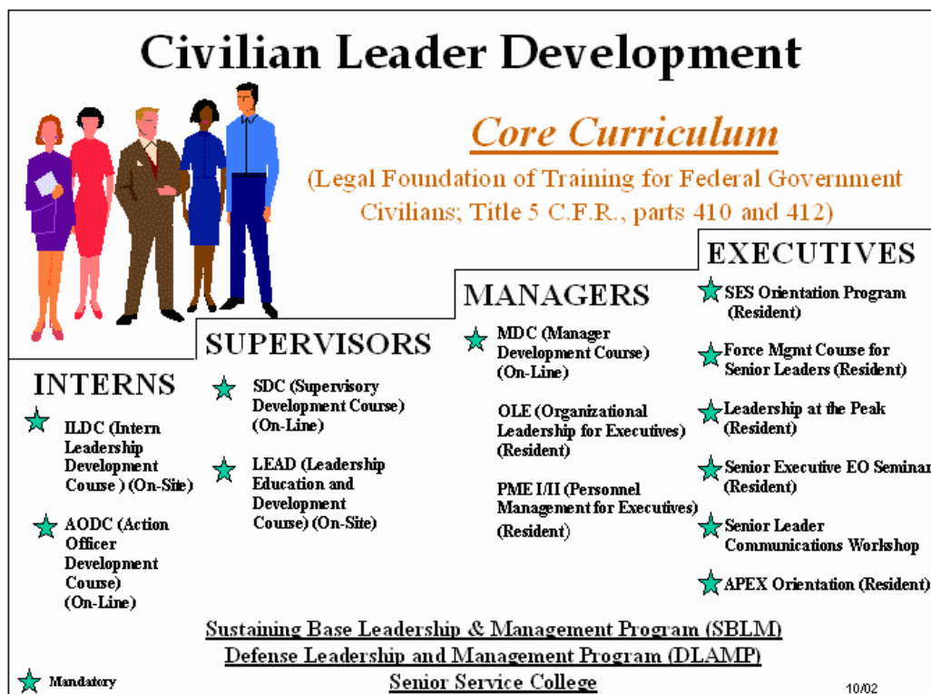
Figure 2-1. Army Civilian Leader Development Core Curriculum

The legal foundation for training for Federal Government civilians is found in Title 5 C.F.R., parts 410 and 412. The Army's Civilian Leadership Development Core Curriculum reflects the mandatory and recommended courses that make up the curriculum. The majority of the courses in the curriculum are considered mandatory, especially at the level indicated. It includes training for the Intern, Supervisor, Manager, and Executive level civilians as depicted in Figure 2-1.