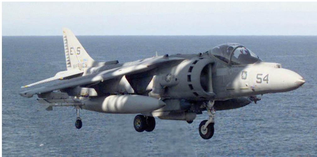
Figure 5: The AV-8B Harrier Aircraft

The organization described in this section is the AV-8B JSSA, located at China Lake, California. It provides software support for the AV-8B Harrier aircraft, shown in Figure 5, for the United States Marine Corps and its allies, Spain and Italy.