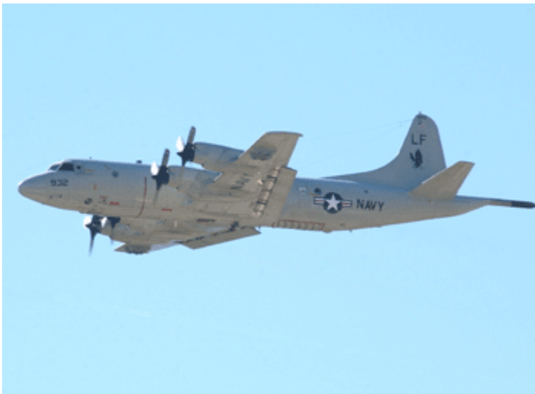
Figure 4: The P-3C Orion Aircraft

The P-3C SSA organization is located at Naval Air Station Patuxent River, Maryland. It provides software support for the P-3C Orion aircraft, shown in Figure 4. The P-3C was originally designed as a land-based, long-range, anti-submarine warfare patrol aircraft, but today is used mostly for battlespace surveillance over both land and sea.