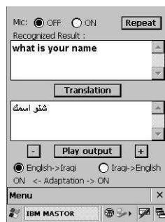
Figure 2 IBM MASTOR system in Windows XP and Windows CE

section 3.A. We found that using context-sensitive pronunciation rules reduces the WER of the grapheme based acoustic model by about 3% (from 36.7% to 35.8%). Based on these results, we decided to use context-sensitive grapheme models in our system.