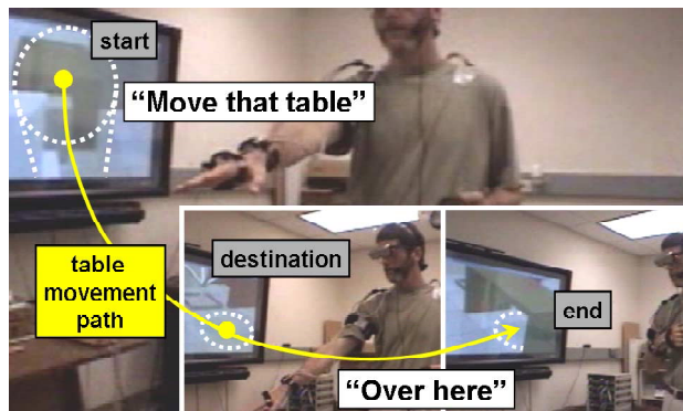
Figure 1: A 4-part multimodal command (speech/point + speech/point) to move a virtual table. The plasma screen shows what the user sees in his HMD. The white-dotted areas (added here) show pointing targets. Turn segmentation is critical to correct multimodal recognition.

The current approach to the multimodal turn segmentation problem, as discussed in the literature, is to wait for some fixed threshold of time before assuming the end of user turn-input [2]. Recent research has sought to reduce this fixed wait time by the use of corpus-based, probabilistic [3] or user-adaptive models [4] of input styles. The motivation for modeling this temporal threshold is to avoid on the one hand what Gupta et al term under-collection errors (in which some user turn-inputs arrive after the start of processing – Table 1: #1, #2), and on the other hand over-collection errors (in which users re-enter inputs due to a perception of system unresponsiveness – Table 1: #3, #4) [3]. Our Introductory Example 2 is an under-collection error. As