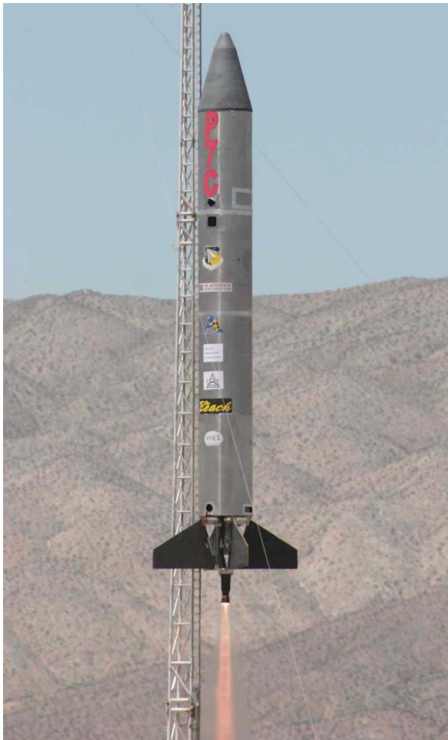
Figure 16. On its Third Flight, the P-7 Manifested a Launch Hardware Tracking System

Post-flight inspections back in the CSULB lab confirmed the initial in-the-field assessment that the P-7 could be returned to flight status with a of minimum refurbishment. Consequently, it was utilized on its third flight on 29 April 2006 (Figure 16) to manifest an Iridium-based launch tracker experiment. 8