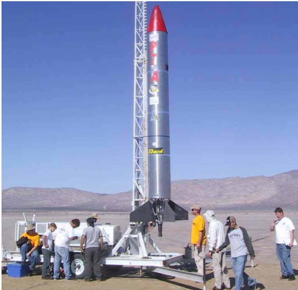
Figure 7. P-7A Undergoing Final Launch Preparations

This ability to accept such a high level of risk of vehicle failure and to make such a decision in real time was the single most important factor to achieving all the pre-test goals. It simply would not have been possible on a more traditional aerospace test program.