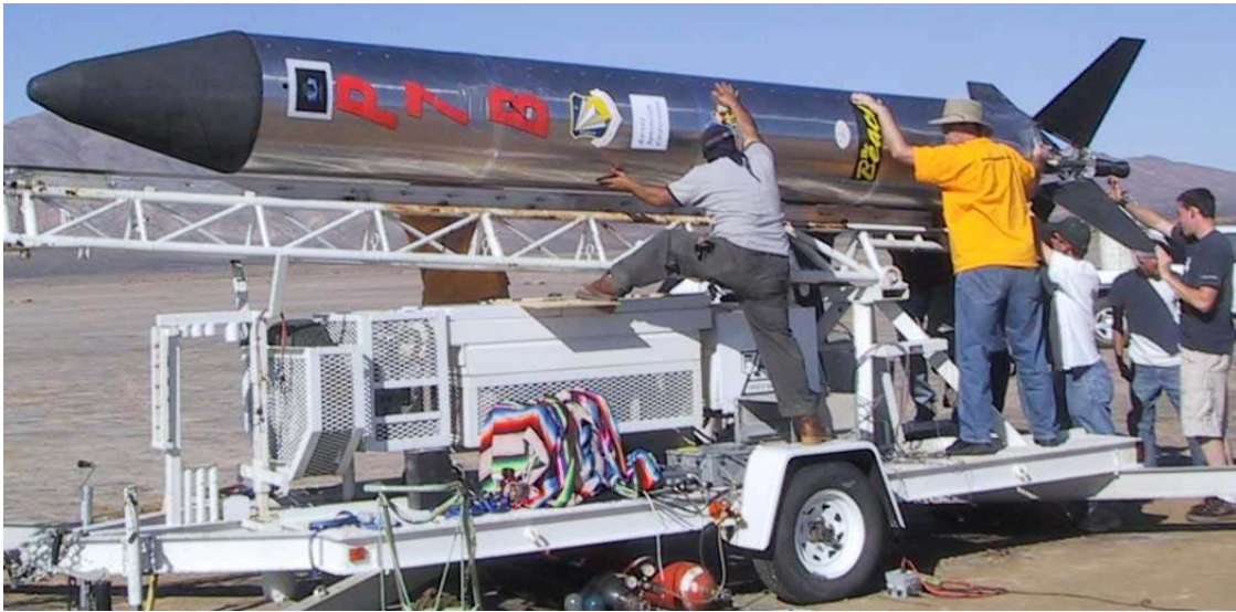
Figure 11. Preparations Underway for Second Launch