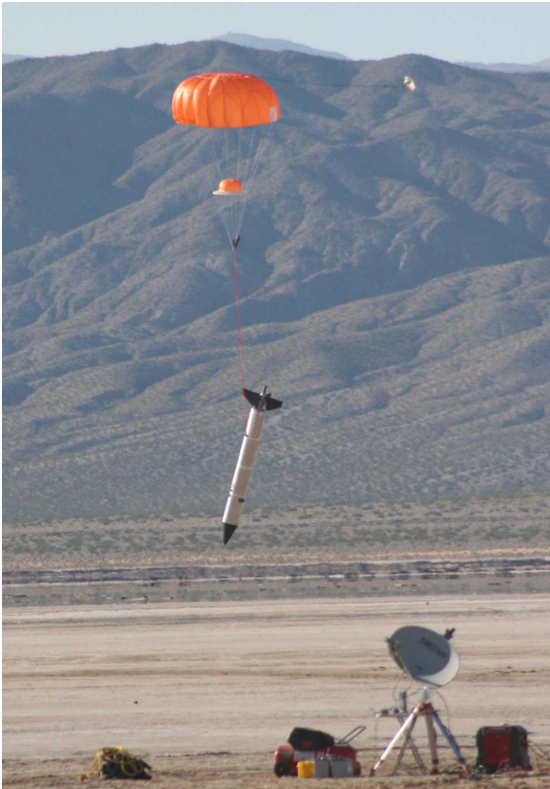
Figure 13. P-7B Just Prior to Landing