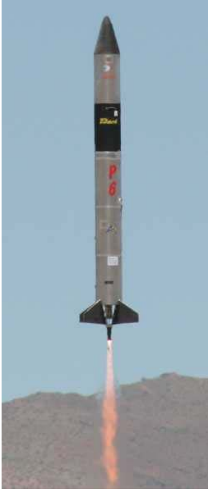
Figure 3. Prospect 6 - Full Scale Prototype NLV in Flight