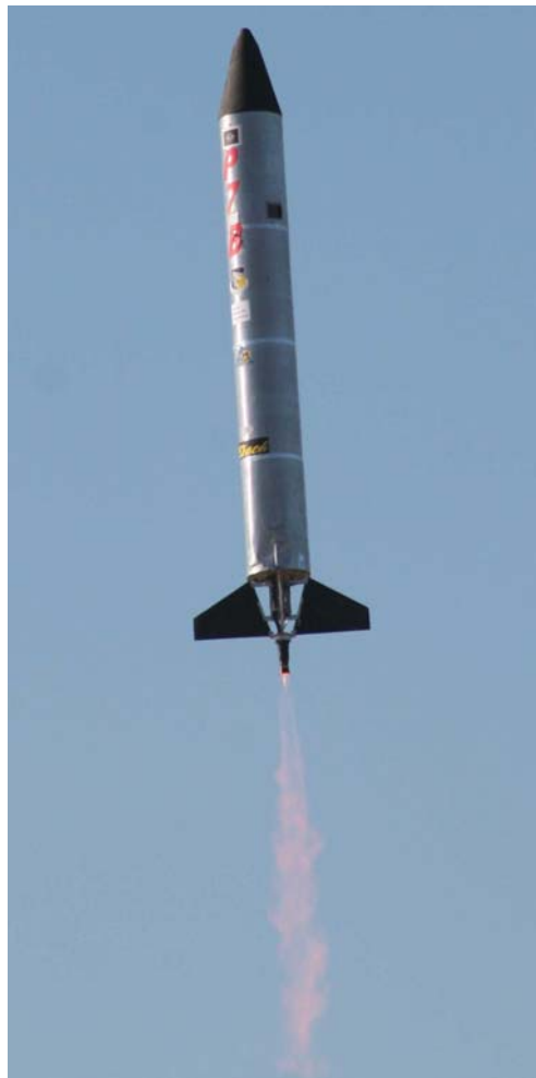
Figure 12. Second Flight Underway