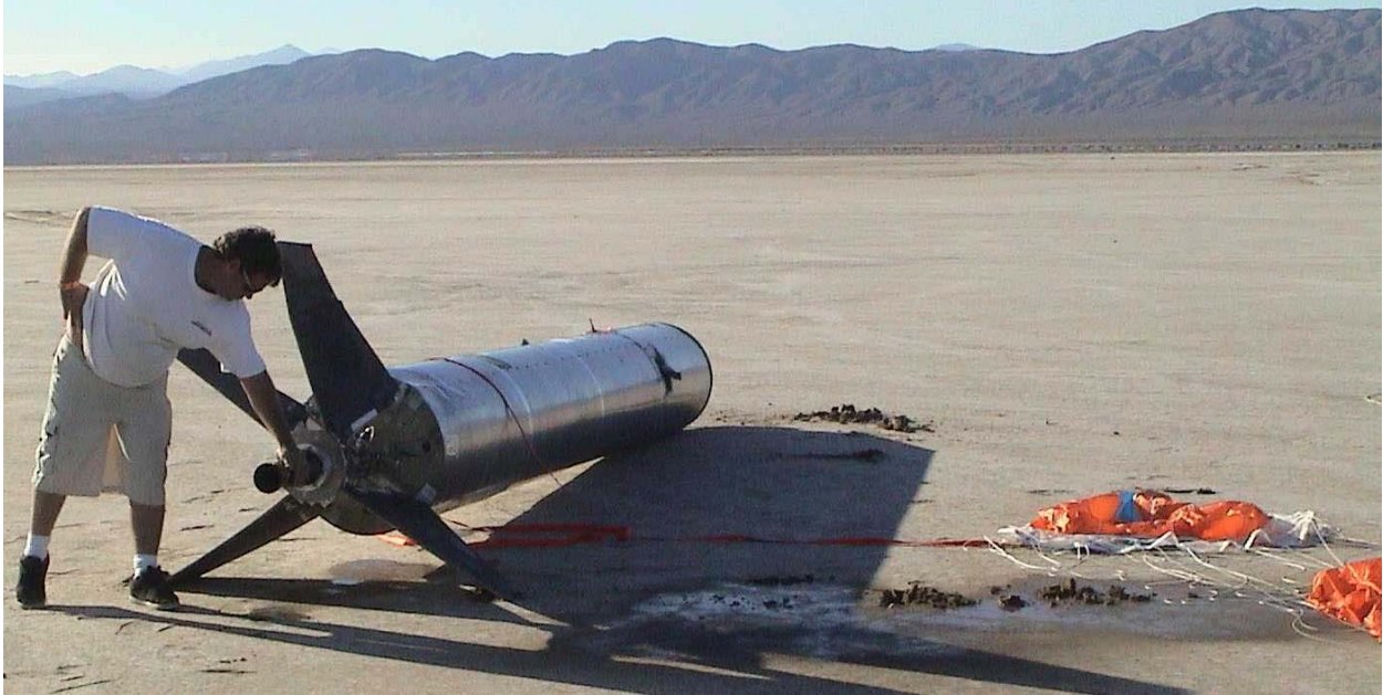
Figure 14. P-7B After Landing