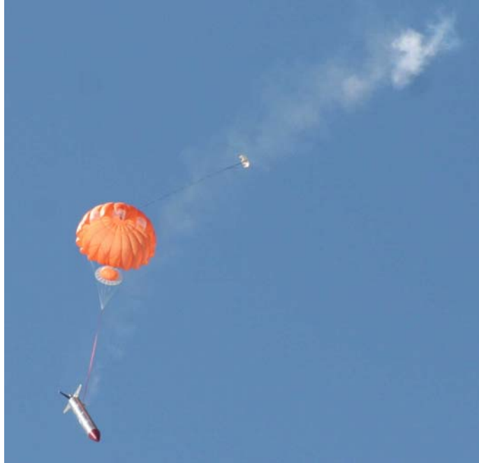
Figure 9. P-7A Parachute Deployment