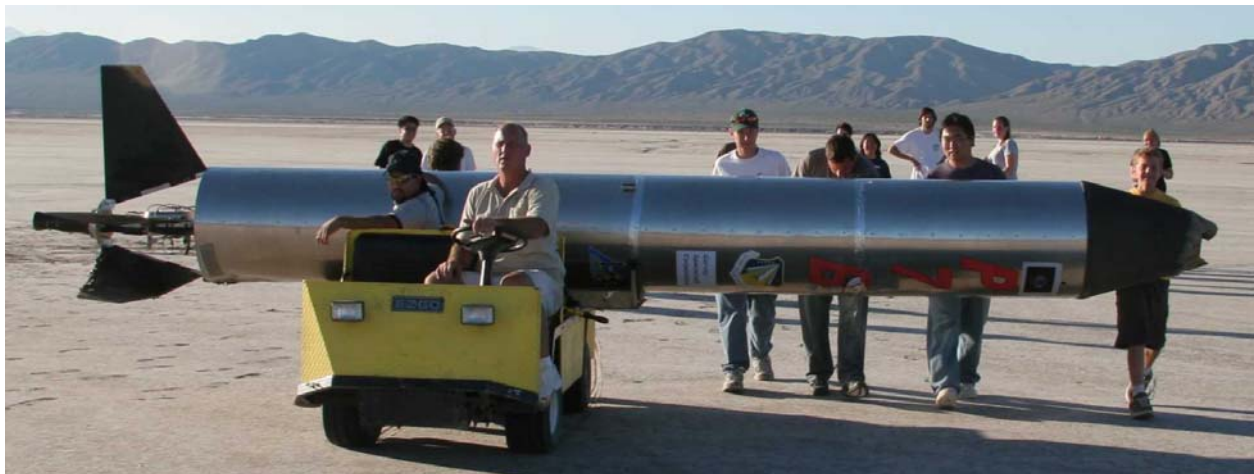
Figure 15. Returning the P-7B to the Launch Site