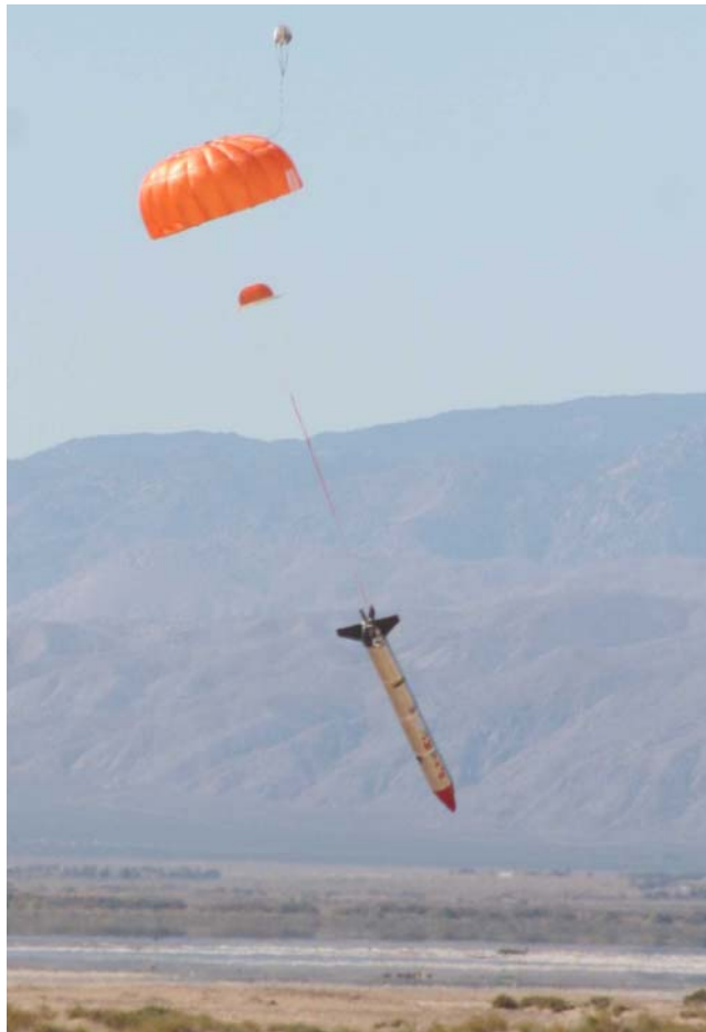
Figure 10. P-7A Landing