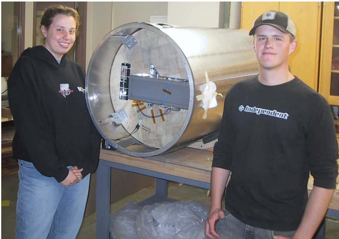
Figure 6. Students with Cal Poly SLO P-POD CubeSat Deployer Mounted in the P-7 Interstage