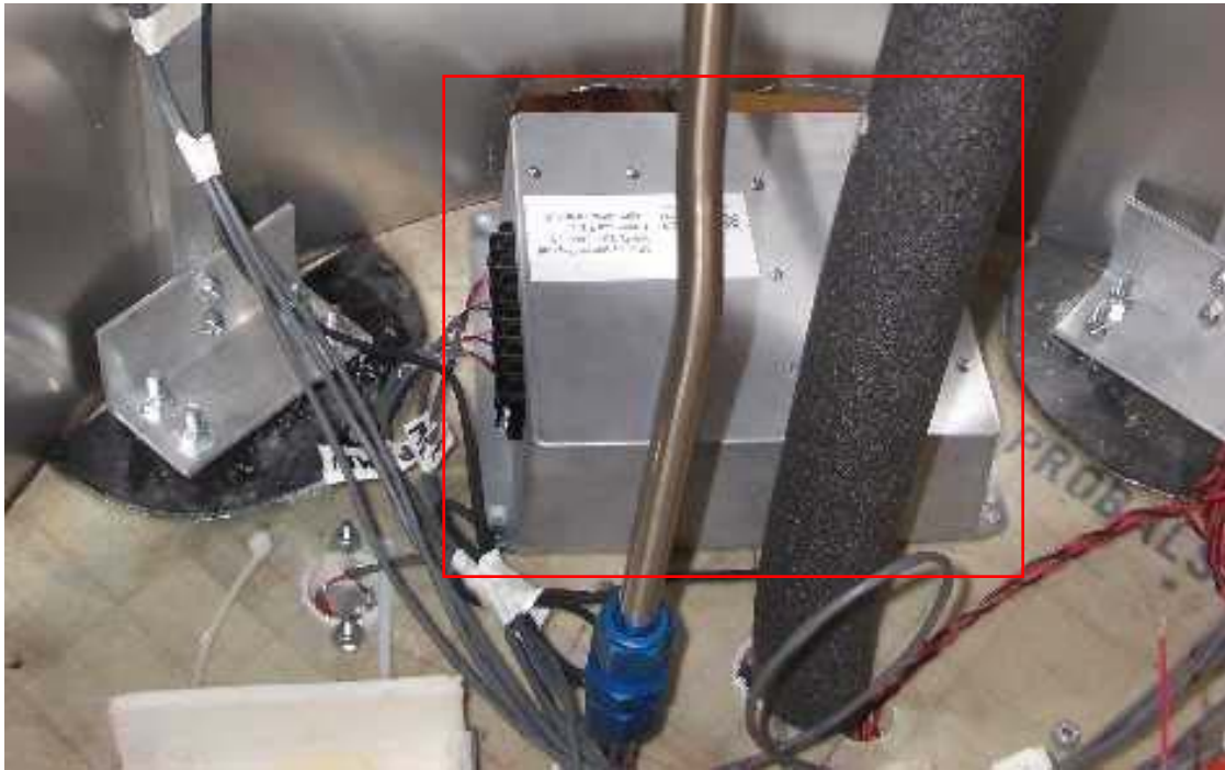
Figure 5. Montana State University Data Logger