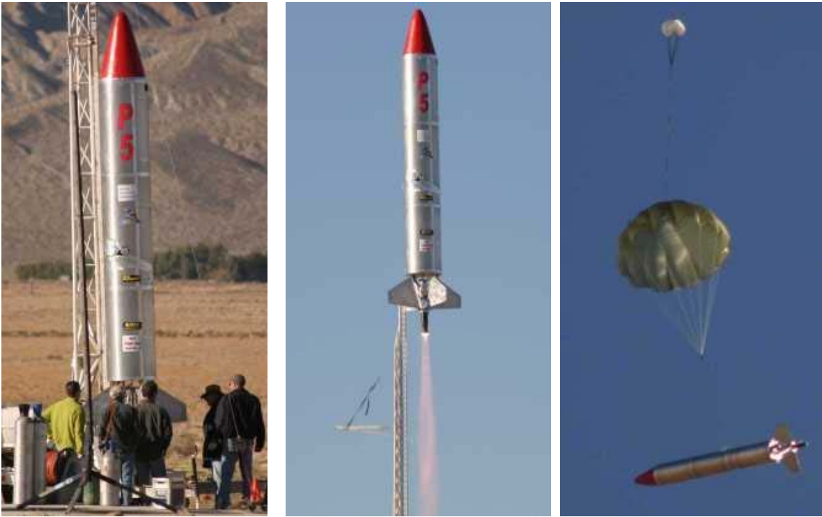
Figure 2. Prospector 5 - Initial NLV Flight Test Prototype

GSC and CSULB have participated in joint research since early 2001 under the California Launch vehicle Education Initiative (CALVEIN). Since 2004, these activities have included the development and initial flight testing of full-scale, low-fidelity prototypes of a proposed expendable NLV that is designed to deliver up to 10 kg of payload to a polar, circular orbit of 250 km. 3, 4 The Prospector 5 (P-5) first demonstrated launch operations and recovery with an NLV-sized first stage (Figure 2). 5 The Prospector 6 (P-6) that followed incorporated the P-5 stage and structural simulators for the interstage and second stage to achieve the full scale of the NLV (Figure 3), while also featuring stage separation and improved landing techniques. 6