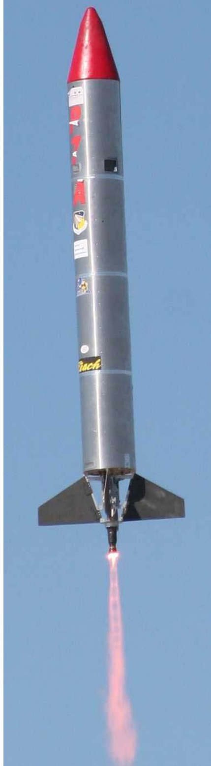
Figure 8. First Flight of the Day