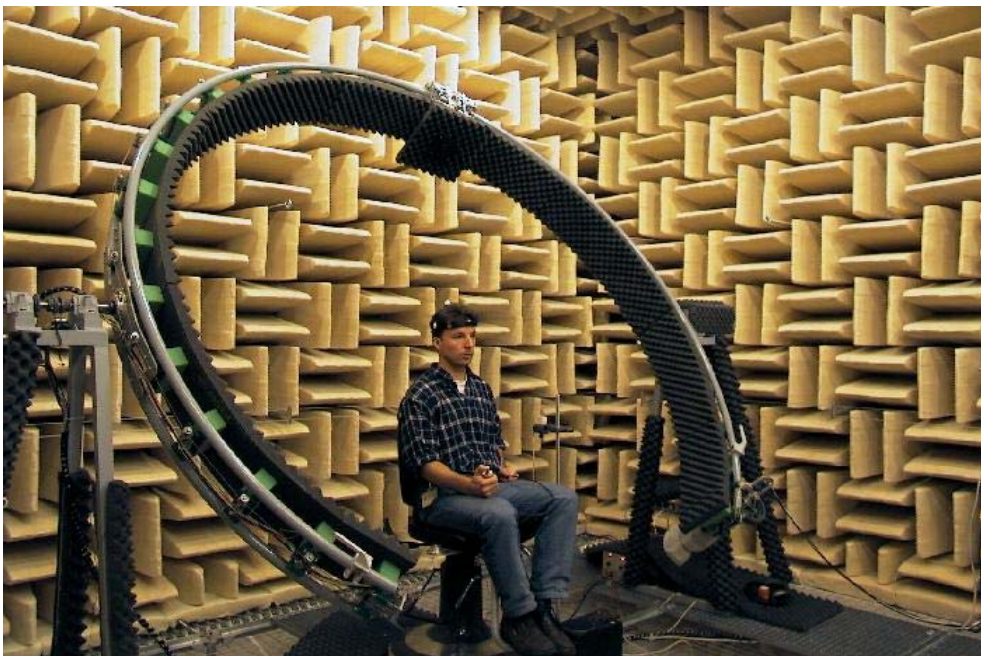
Figure 1: Setup for measuring head-related transfer functions

The system developed by Bronkhorst (2002) has only 2 microphones per array and is therefore not capable of simulating directional dependencies outside the plane passing through the microphones. In the current study, an improved version was developed that has arrays with 3 microphones placed on the corners of an equilateral triangle. The system was evaluated in a sound localization experiment. Localization performance was measured for passive hearing protection and for hearing protection equipped with either single microphones or microphone arrays, using open-ear performance as reference. The system was also subjected to an acoustical validation.